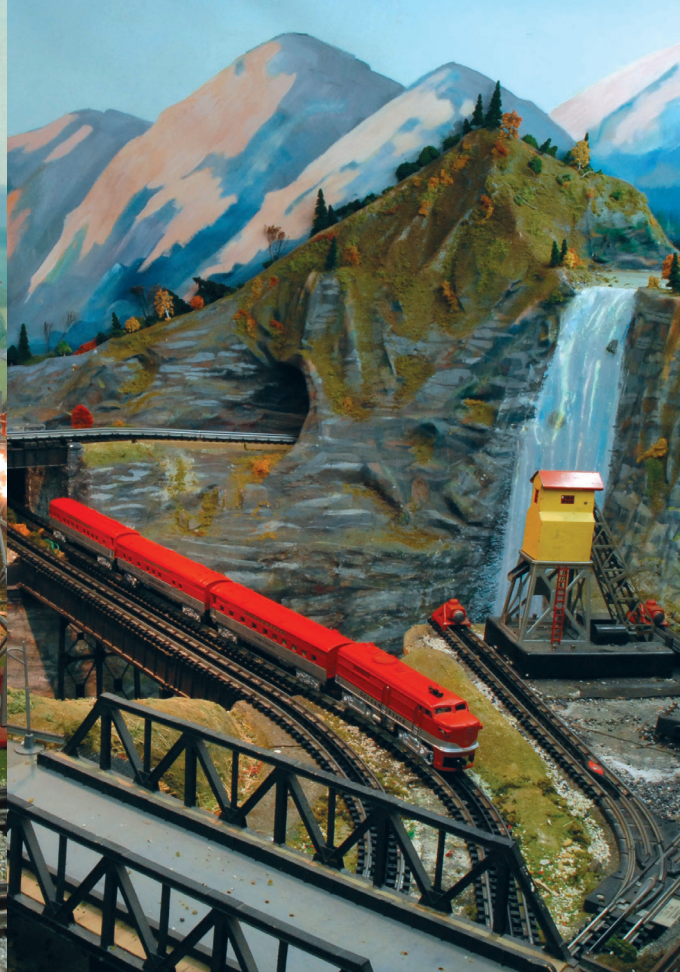
FALL IN LETCHWORTH PARK