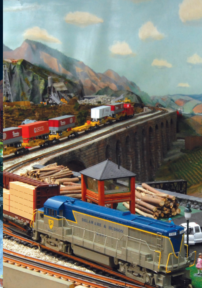
SPRING IN THE COUNTRYSIDE