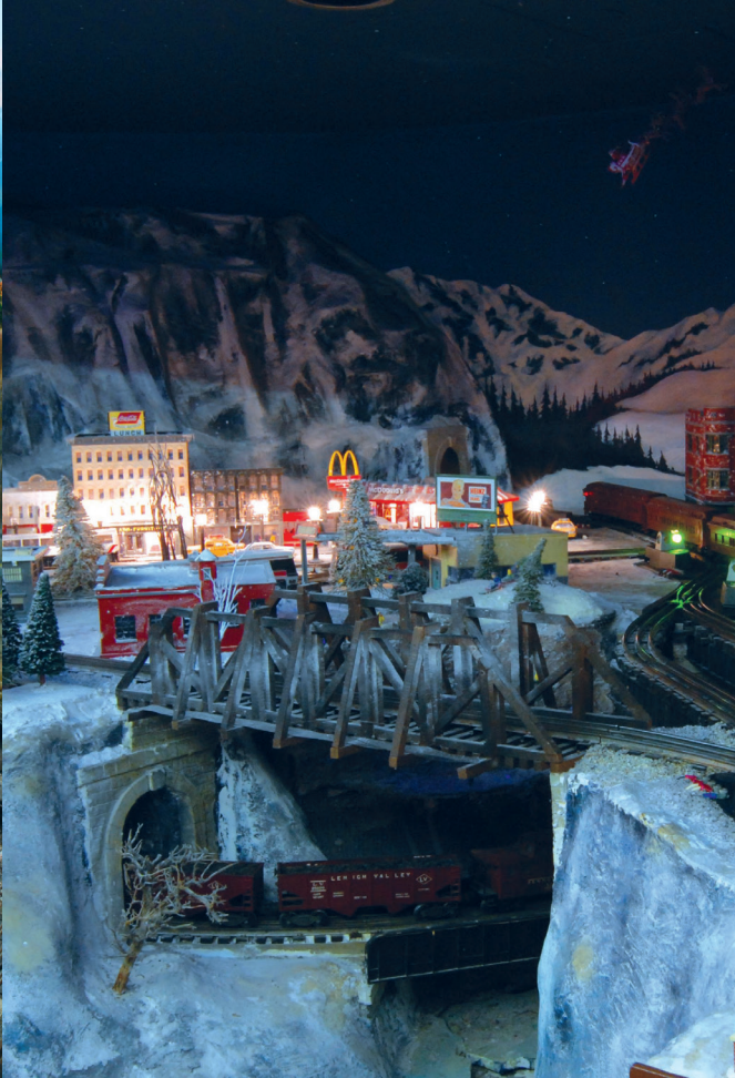
WINTER IN THE MOUNTAINS