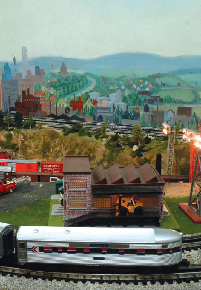
SUMMER IN THE CITY