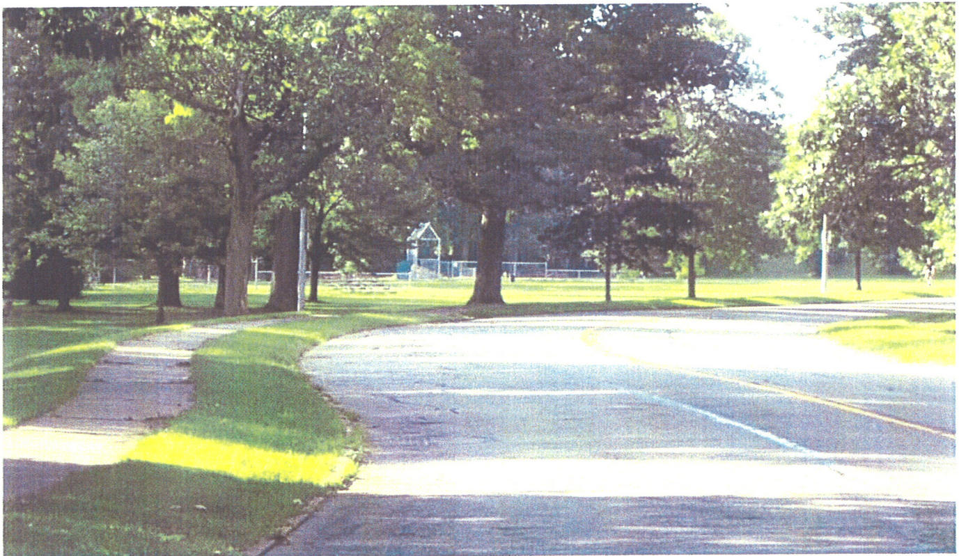
Photo 6: The distinctive 'S' curve will be retained in the redesign when the road is narrowed.