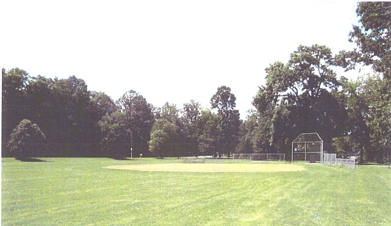
Photo 13: The two ball fields will be reorientated more closely to their historic alignment and drainage will be improved.