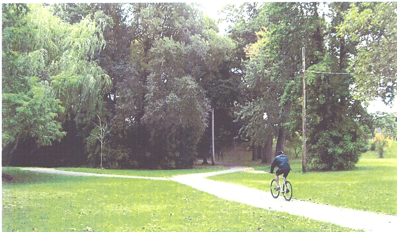
Photo 12: Some segments of the existing trail will be redesigned to incorporate more graceful lines and improve visibility.