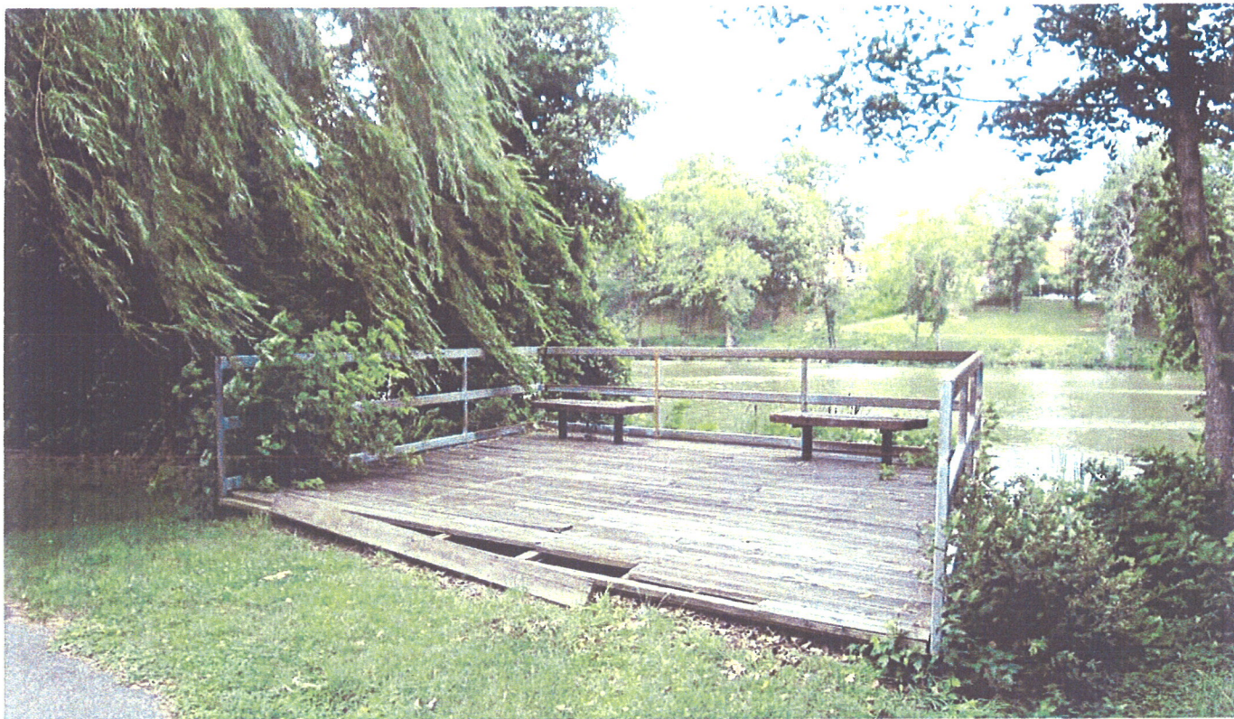
Photo 11: The existing river overlook will be rehabilitated and a new overlook is proposed to be added further downstream.