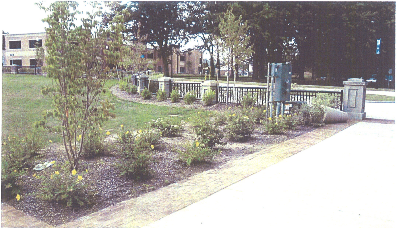
Photo 1: Phase 1 Public Improvements included decorative piers/fencing, landscape plantings, and a small public plaza.