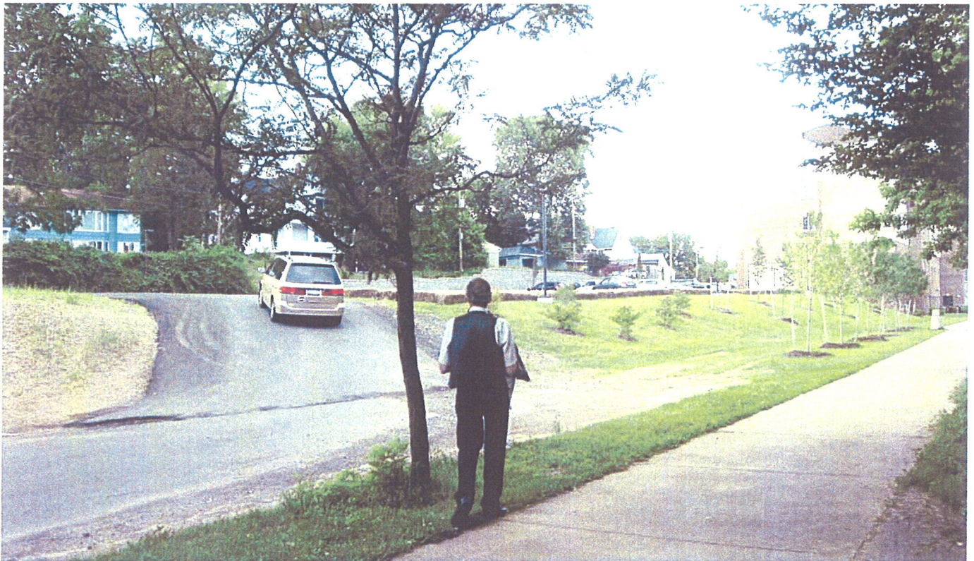
Photo 10: The vehicular connection between the park and the private development will be redesigned to be less steep and include a landscape screen.