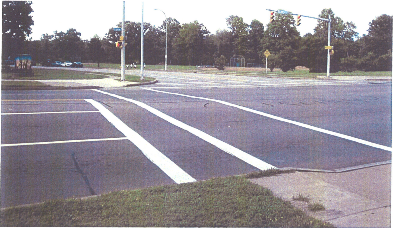
Photo 3: The existing park entrance at Emwood Avenue is overly wide, lacks signage, and does not feel park like.