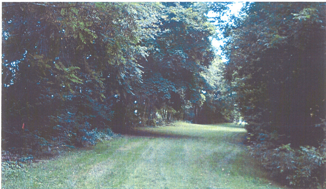
Photo 14: A stonedust trail is proposed through the former alignment of the Genesee Valley Canal.