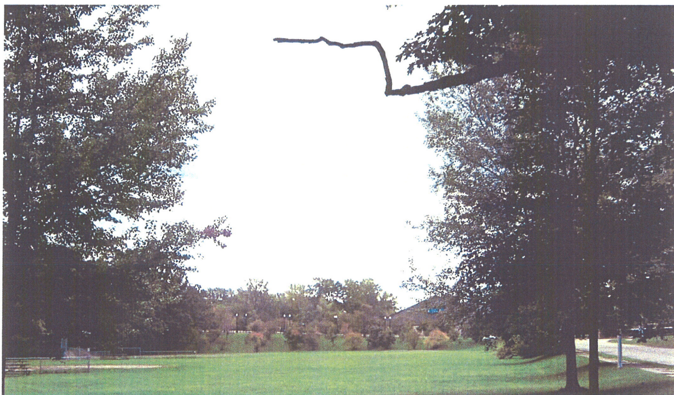
Photo 8: A new turn-around loop will curve into a portion of the grassy field, but will be designed like historic carriage loops found in other Olmsted Parks.