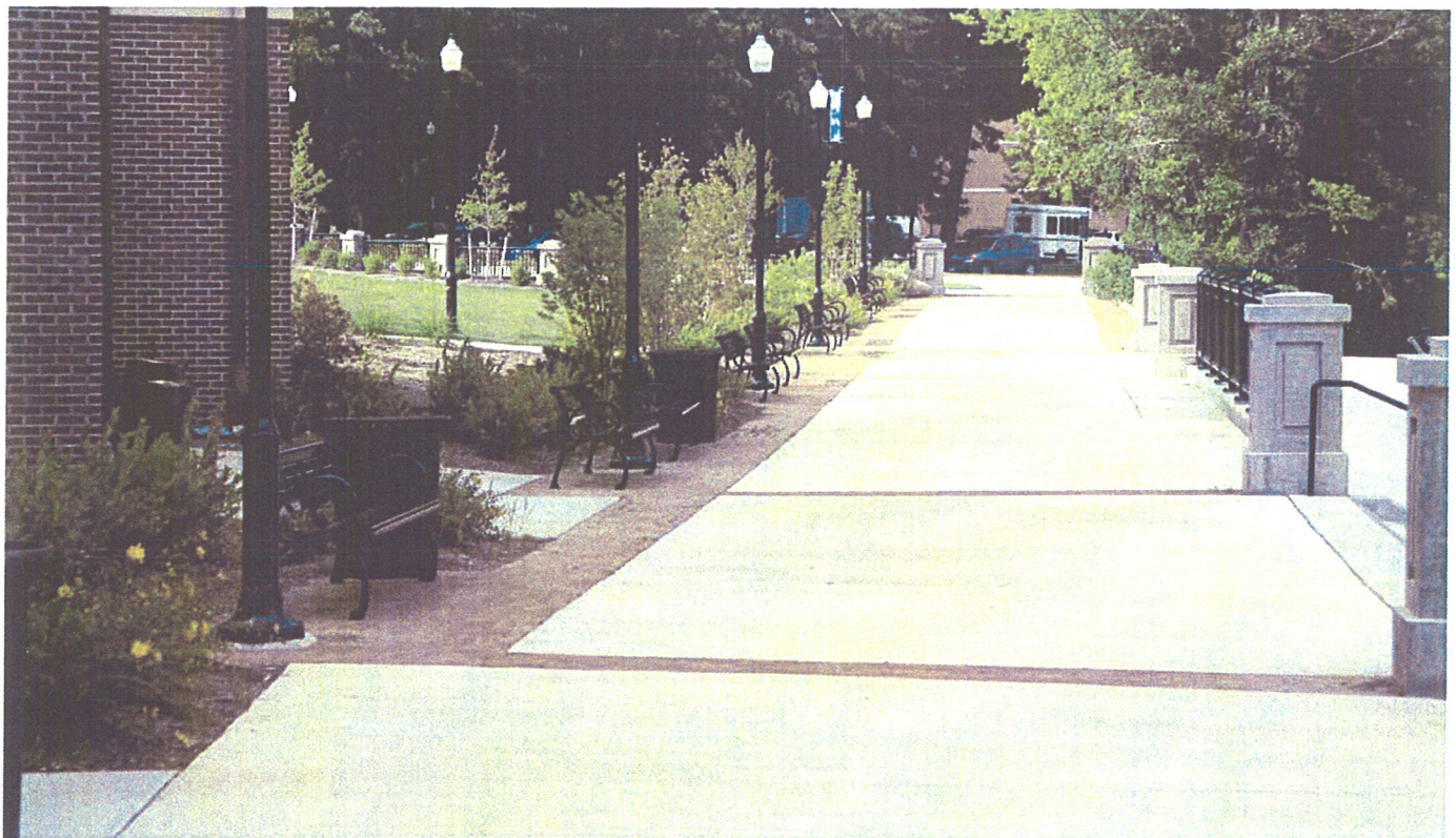
Photo 2: Phase 1 Public Improvements also included the construction of a public promenade along the river with boat tie ups.