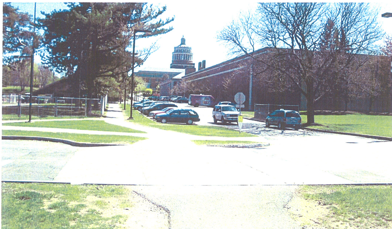
Photo 7: Tabled crosswalks are proposed in order to slow traffic and better accomodate non-motorized park uses. The tabled crosswalk shown above is currently used on Wilson Boulevard at the University of Rochester.