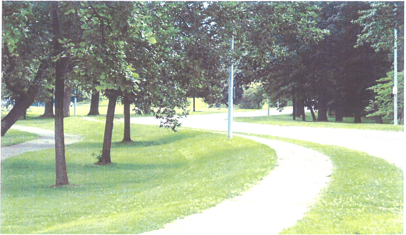
Photo 9: The concrete sidewalks will be removed in favor of meandering asphalt trails.