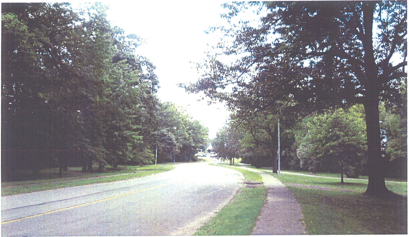
Photo 5: The existing road segment is four lanes wide and includes lighting that is inappropriate for an Olmsted Park.