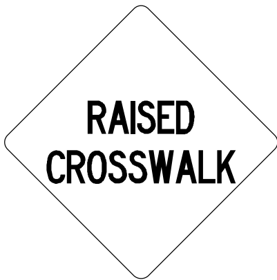
W17-1 30" x 30"