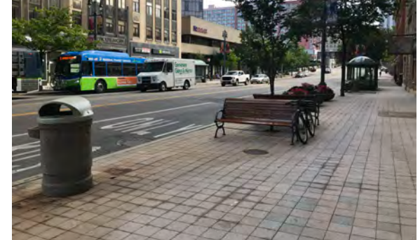
Dedicated Bus lanes are provided on both sides of Main Street

The peak hour volumes were entered into the MCDOT AM and PM system Synchro model and intersection splits