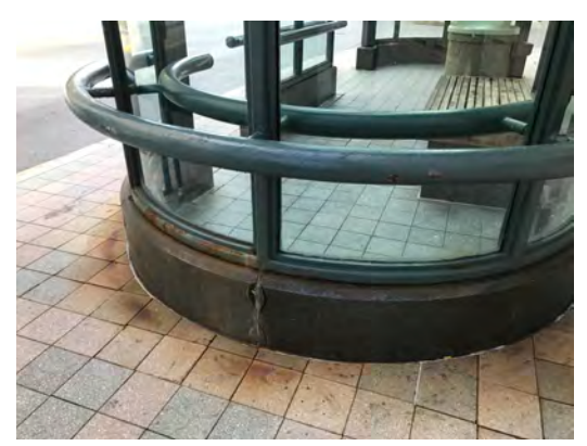
Deteriorated Bus Shelter

The project will replace the existing bus stop shelters with a newer shelter designed for today's transit user. This new shelter will enhance the users experience of the transit system at these stops.