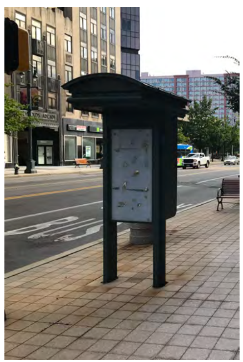
Obsolete Pay Phone Stand

The existing bicycle facilities within the area are also insufficient for today's demands. The City of Rochester's Bicycle Master Plan (January 2011) references a portion of the project as a priority segment by the public. This corridor, due to the bridge crossing over the Genesee River, is particularly important to regional network operations. The corridor lacks or has minimal accommodations for today's cyclists. The revitalization and enhancements proposed under this project provide the opportunity to correct many of these deficiencies.