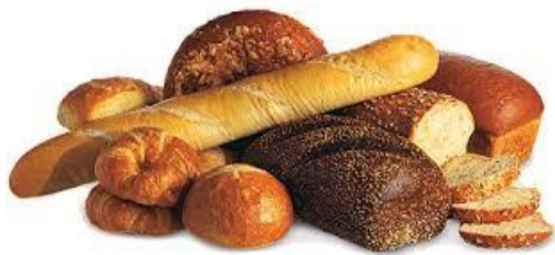
Bread, Baked Goods