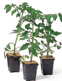
Plants that Grow Food