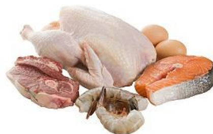
Meats and Seafood