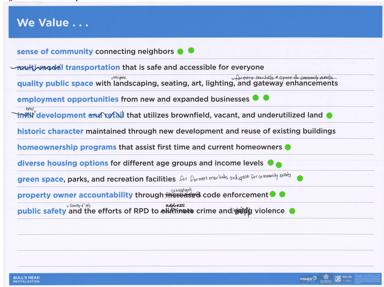
Figure 1: PAC member input on draft value statements