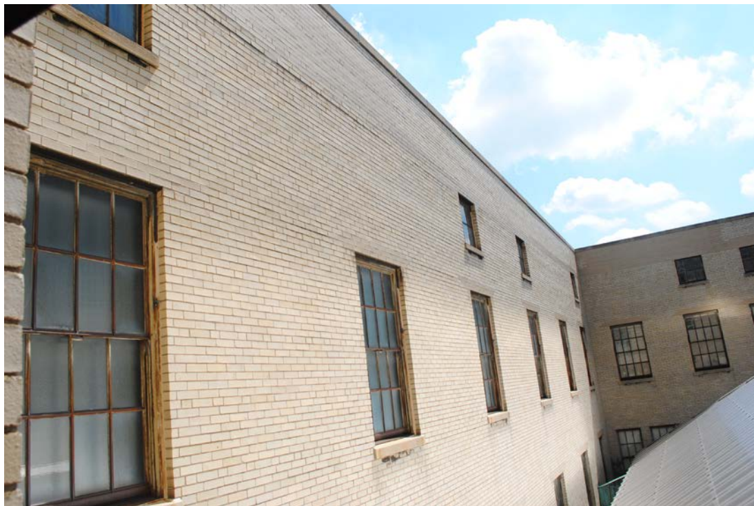
Lightwell, rusted windows and lintels