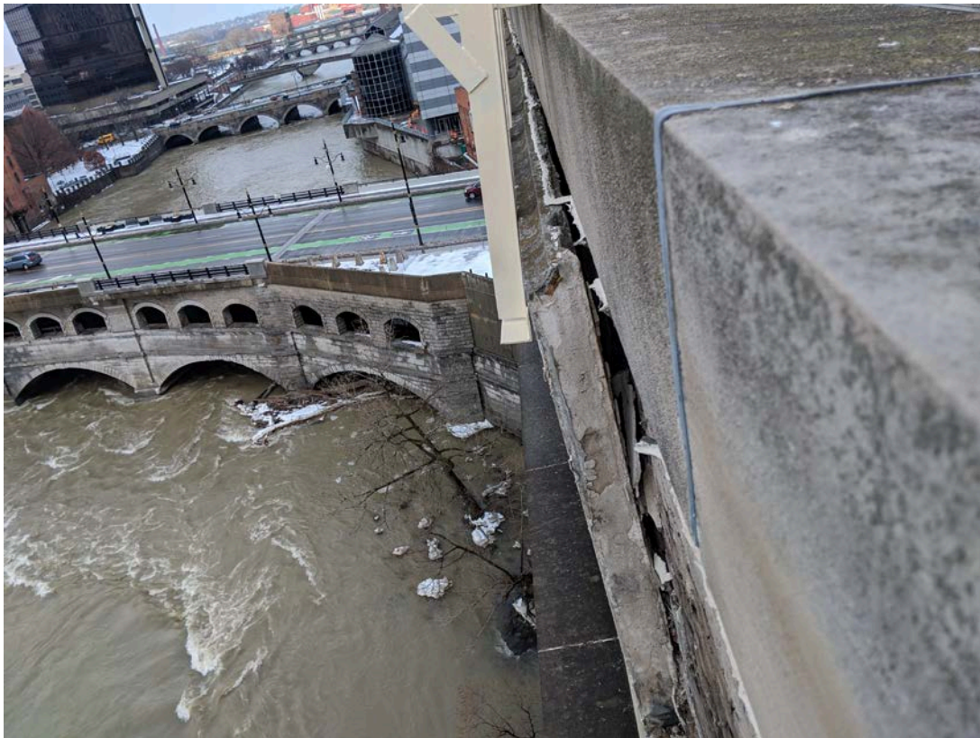
Limestone out of plane with temporary support