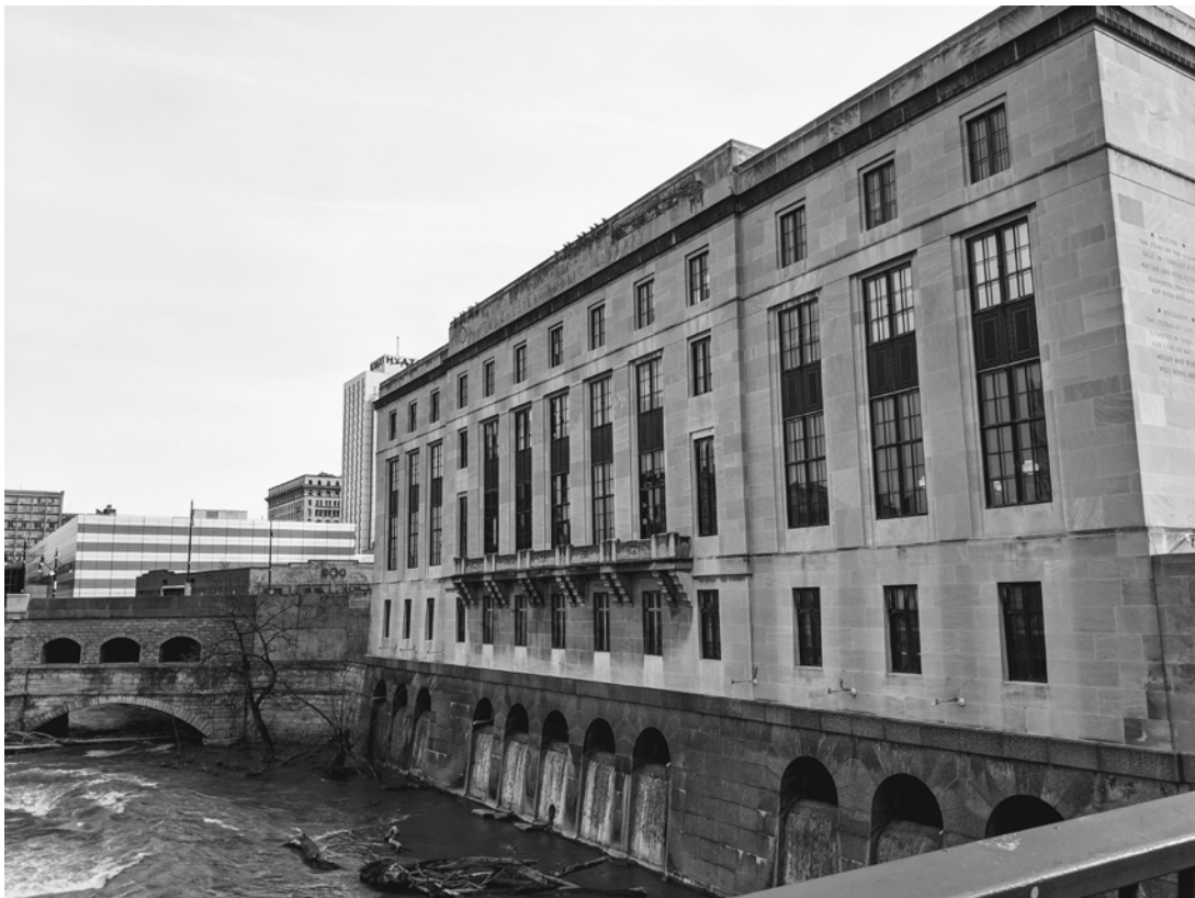
From Court St. Bridge