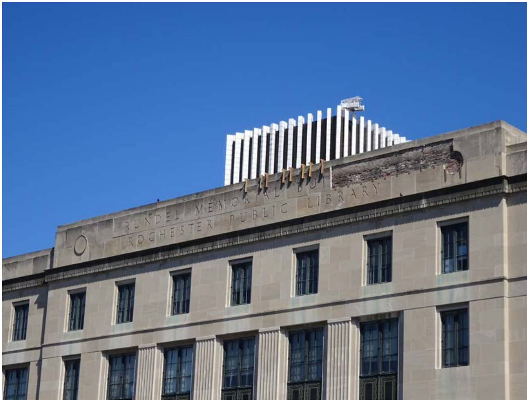
Fallen limestone and temporary supports on the west facade