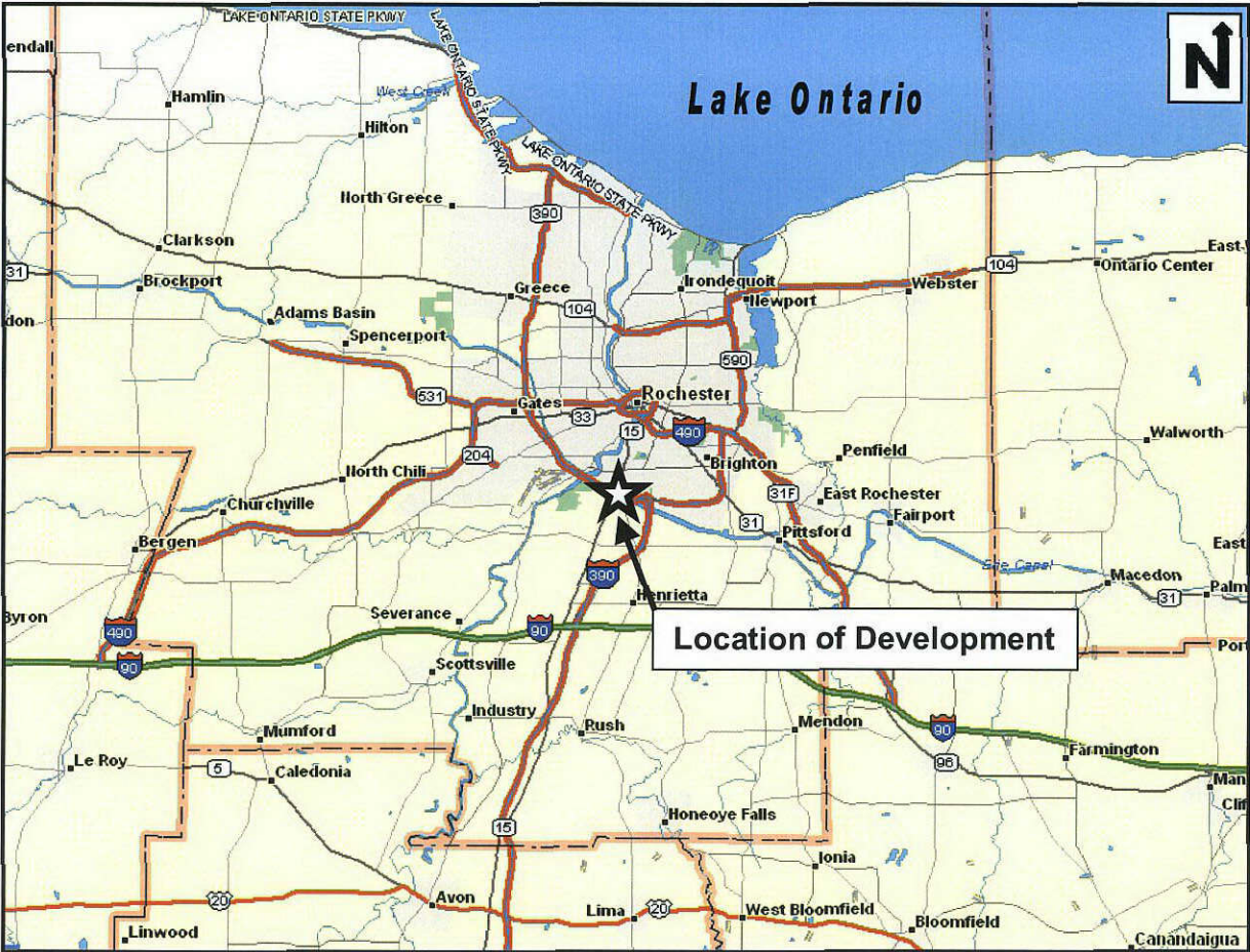
Figure 1 - Regional Location Map

The subject of this Traffic Impact Study (TIS) is the Citygate development proposed in the City of Rochester and Town of Brighton. The location of Citygate is within the southeast quadrant of the intersection of East Henrietta Road (Route 15A) with Westfall Road. A regional project location map is shown in Figure 1. See Figure 2 for the site location. The purpose of the TIS is to document the traffic conditions of the subject site area and to evaluate future traffic conditions and impacts.