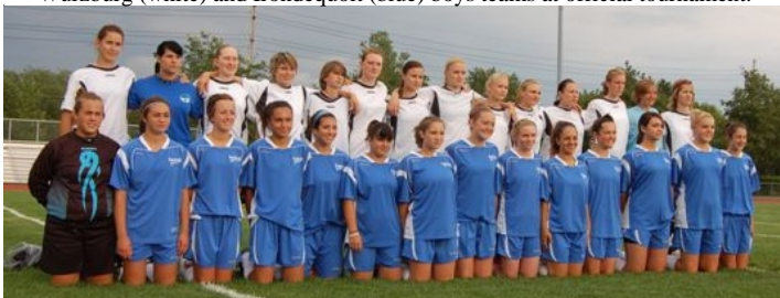
Würzburg (white) and Irondequoit (blue) girls teams at official tournament.