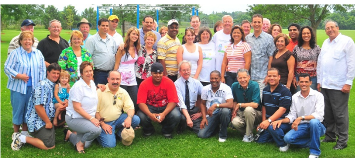
PP Delegation, PP-R committee, and Dominican Hope donors at picnic in Lima.