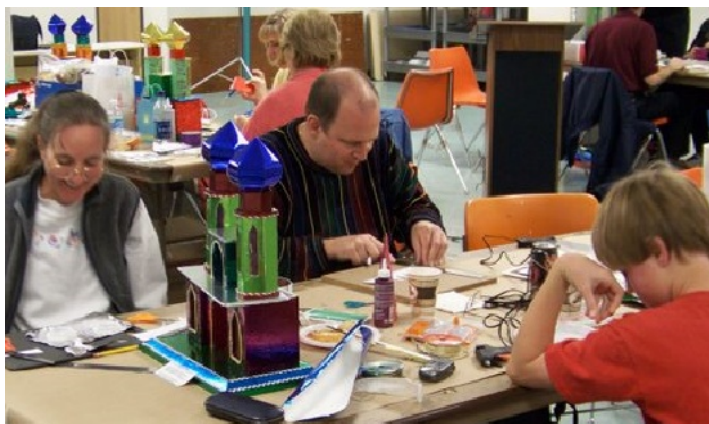
Cunningham family at work, 2008 Workshop.