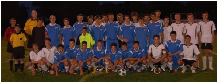
Würzburg (white) and Irondequoit (blue) boys teams at official tournament.

The Irondequoit Soccer Club hosted 30 young players of two Würzburg teams August for tours and a tournament on August 8th at McAvoy Field. The games were well