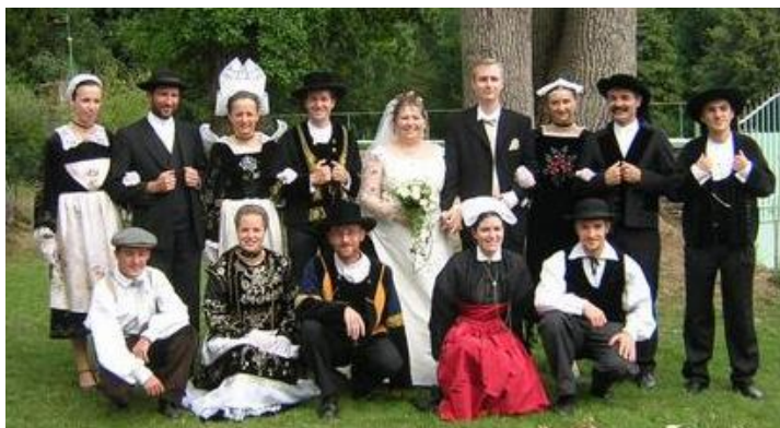
Cercle Celtique to perform at Ganondagan Festival, July 25 & 26

The award-winning Cercle Celtique of Rennes will visit Rochester July 22-28 to tour and perform their traditional Breton music and dances. Founded in Rennes in 1932 to preserve and promote traditional Breton dance and music, the Cercle Celtique has traveled throughout Europe and to Japan to perform in cultural festivals.