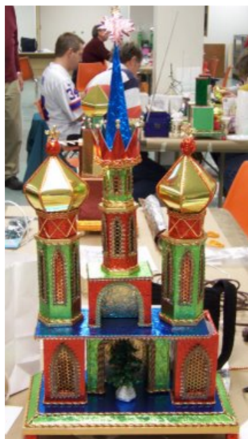
Gagne szopka, '08 Workshop, day 2

and relatives from the northeastern US who traveled to attend the 2007 and 2008 szopka workshops sponsored by KRSCC and the Polish Heritage Society of Rochester (PHSR).