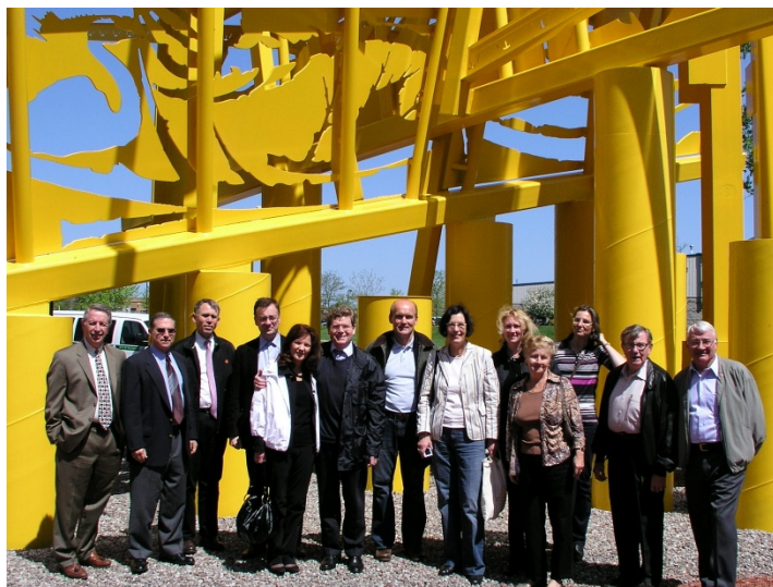
Delegation with Albert Paley sculpture at Klein Steel

tion came fully prepared to learn about our community and develop new connections to expand on the 45 years of successes of the Würzburg-Rochester connection.