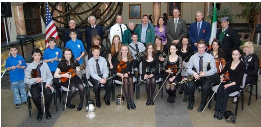
Rochester City Hall concert.

We have also enjoyed participating in the many important celebrations marking anniversaries or other significant milestones reached by many of our other ISCOR committees. It has been an exciting Sister Cities year.