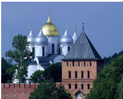
Image City Photo Exhibit Celebrates 1150 th Anniversary In honor of the 1150 th anniversary of the founding of Velikiy Novgorod, Linkages will sponsor a photo exhibit of the work of photographers in