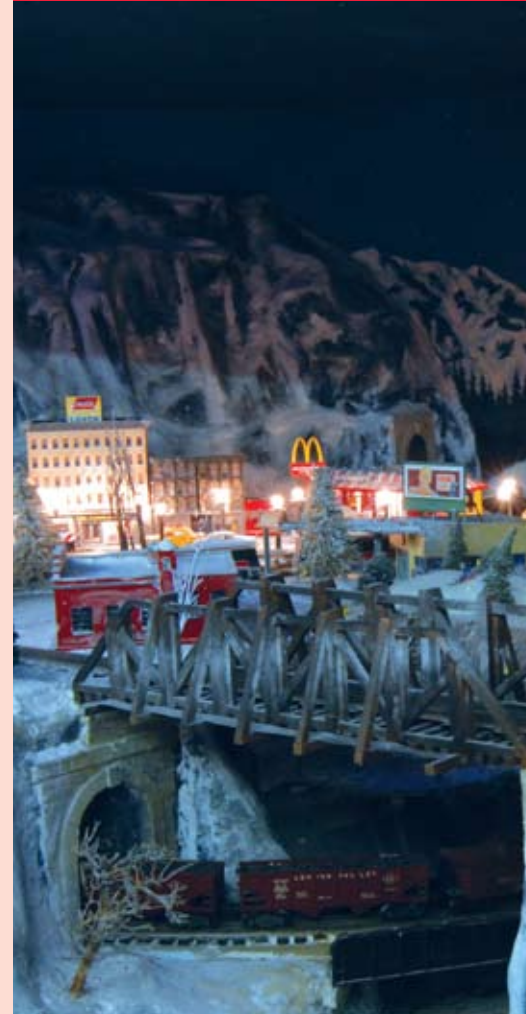
Winter in the Mountains