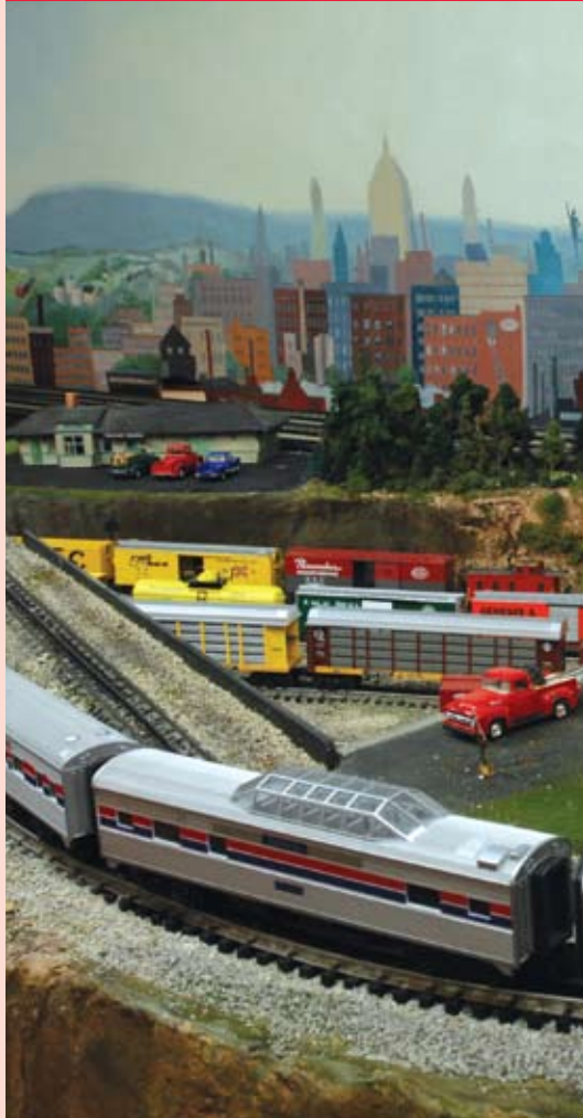
Summer in the City