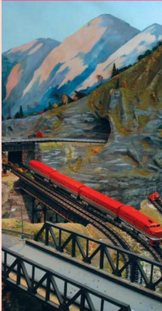
Fall in Letchworth State Park