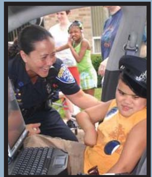
PAL Event (Page 3)