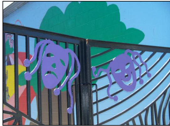
#5 Gate near the Dazzle Theater