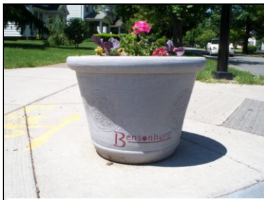
#6 Planters in Bensonhurst