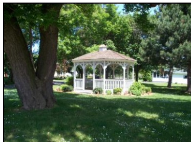
#7 Gazebo on N. Winton Rd.