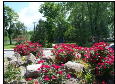
#8 Blossom Rd. community garden