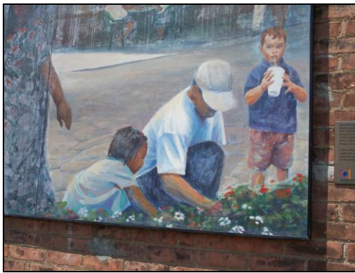
#4 Mural detail @ Culver and Merchants