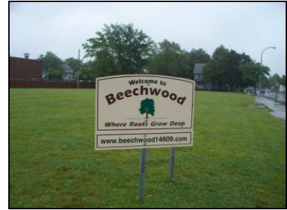
Neighborhood signs greet visitors to #1 Hazelwood Terrace; #2 North Winton Village; and #3 Beechwood