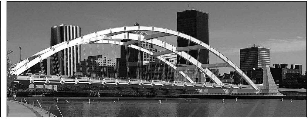
"Restoring Hope, Rebuilding Community"