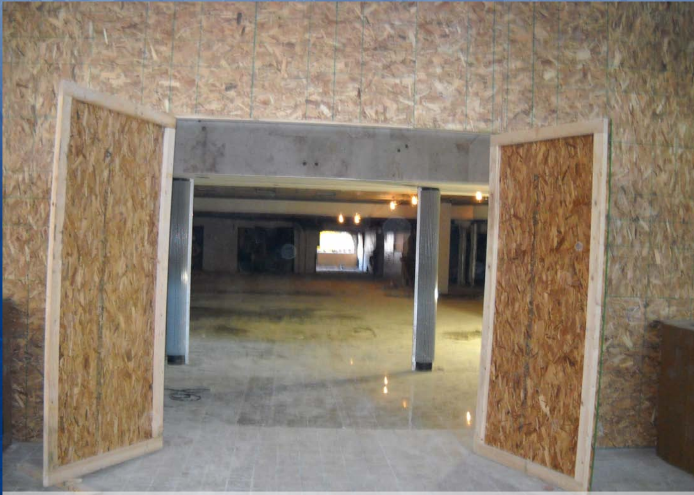
Mall 1 st Floor Hard Wall Construction