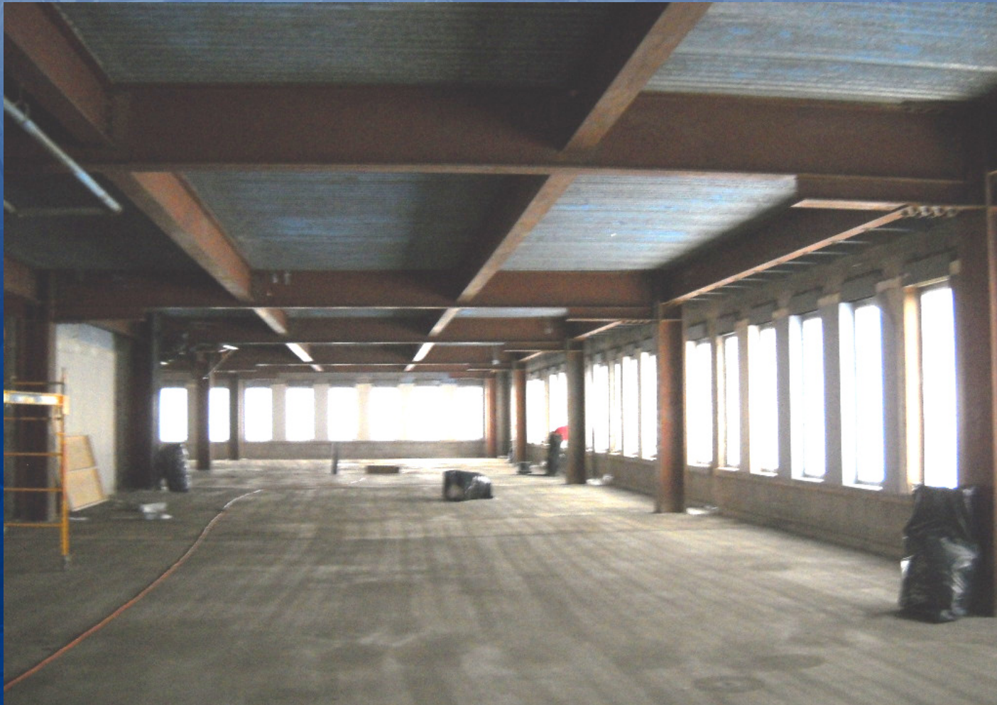
Tower 12 th Floor Post Abatement and Clearance