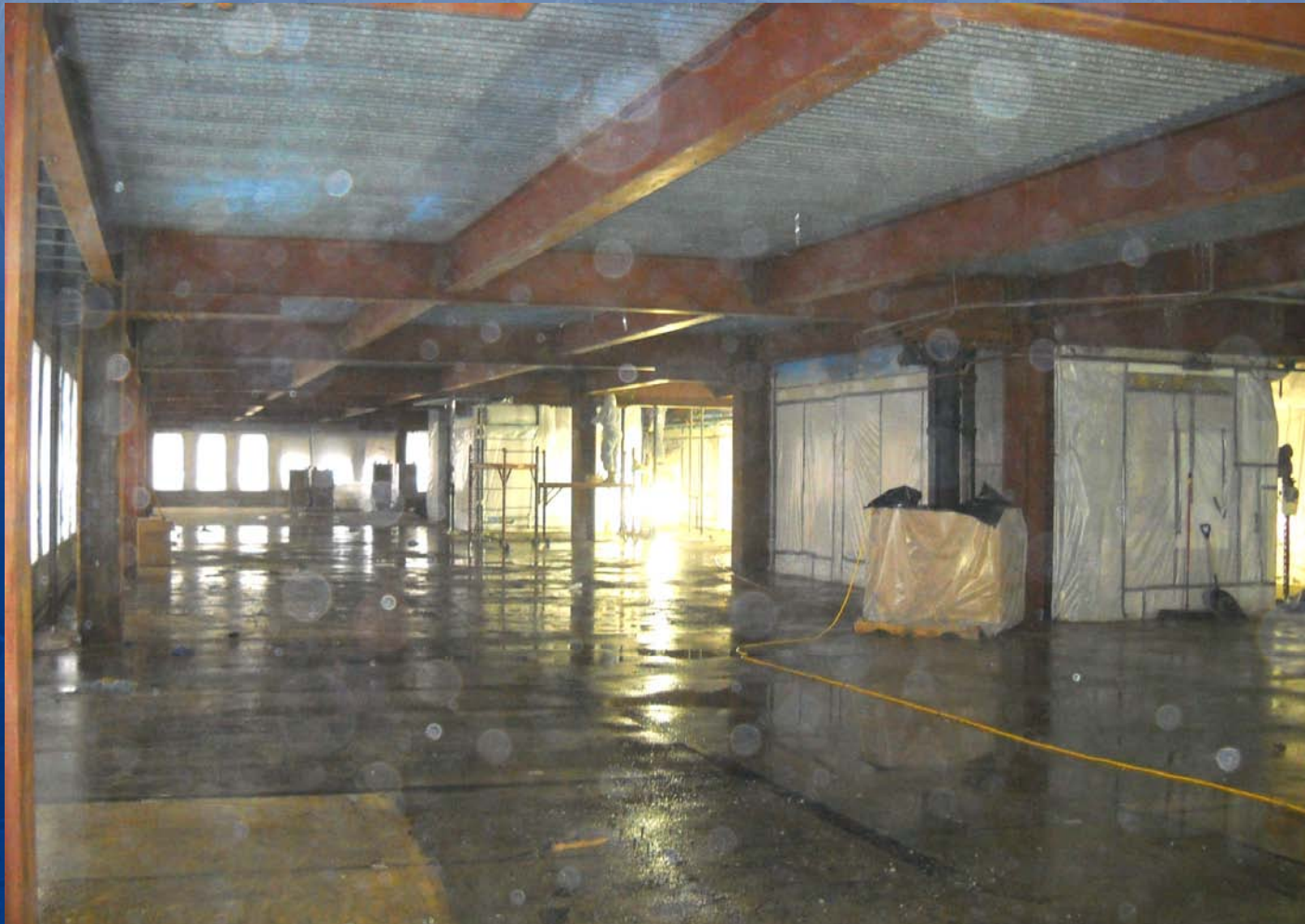
Tower 12 th Floor Under Containment