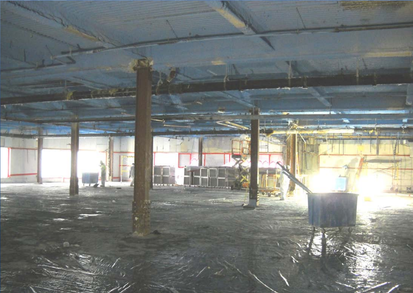
Mall Southwest Work Area West End