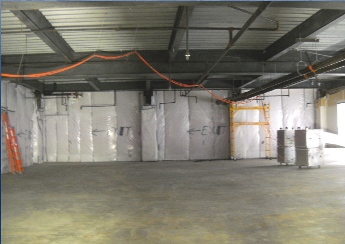
McCurdy's 6 th Floor Containment