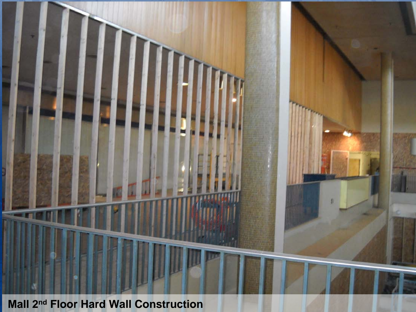
Mall 2 nd Floor Hard Wall Construction