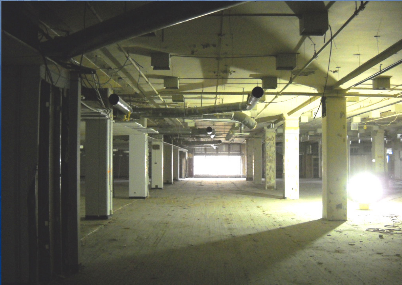
McCurdy's 4 th Floor Soft Demolition