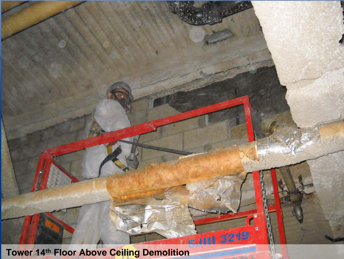
Tower 14 th Floor Above Ceiling Demolition