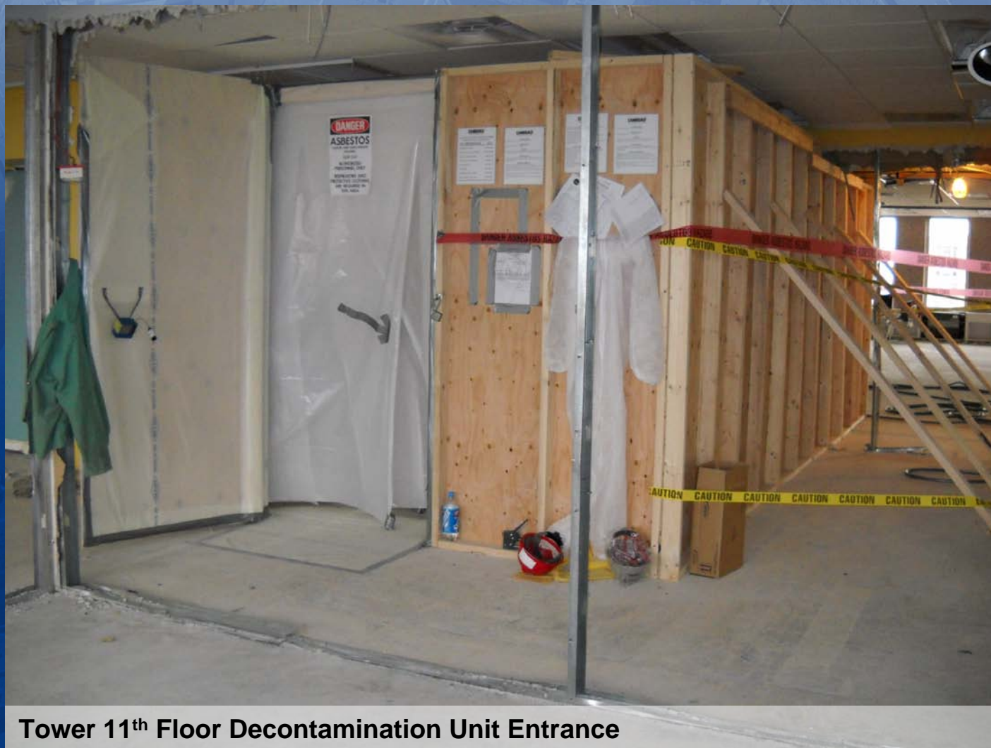
Tower 11 th Floor Decontamination Unit Entrance