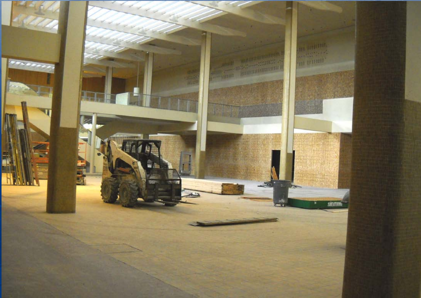
Mall Preparation Work