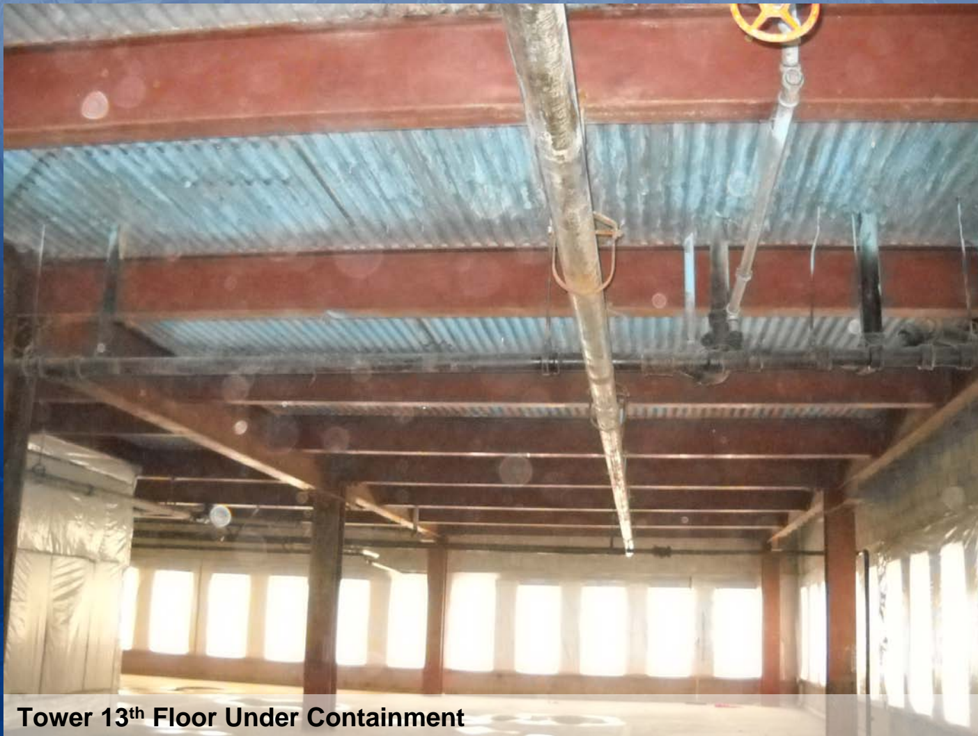
Tower 13 th Floor Under Containment