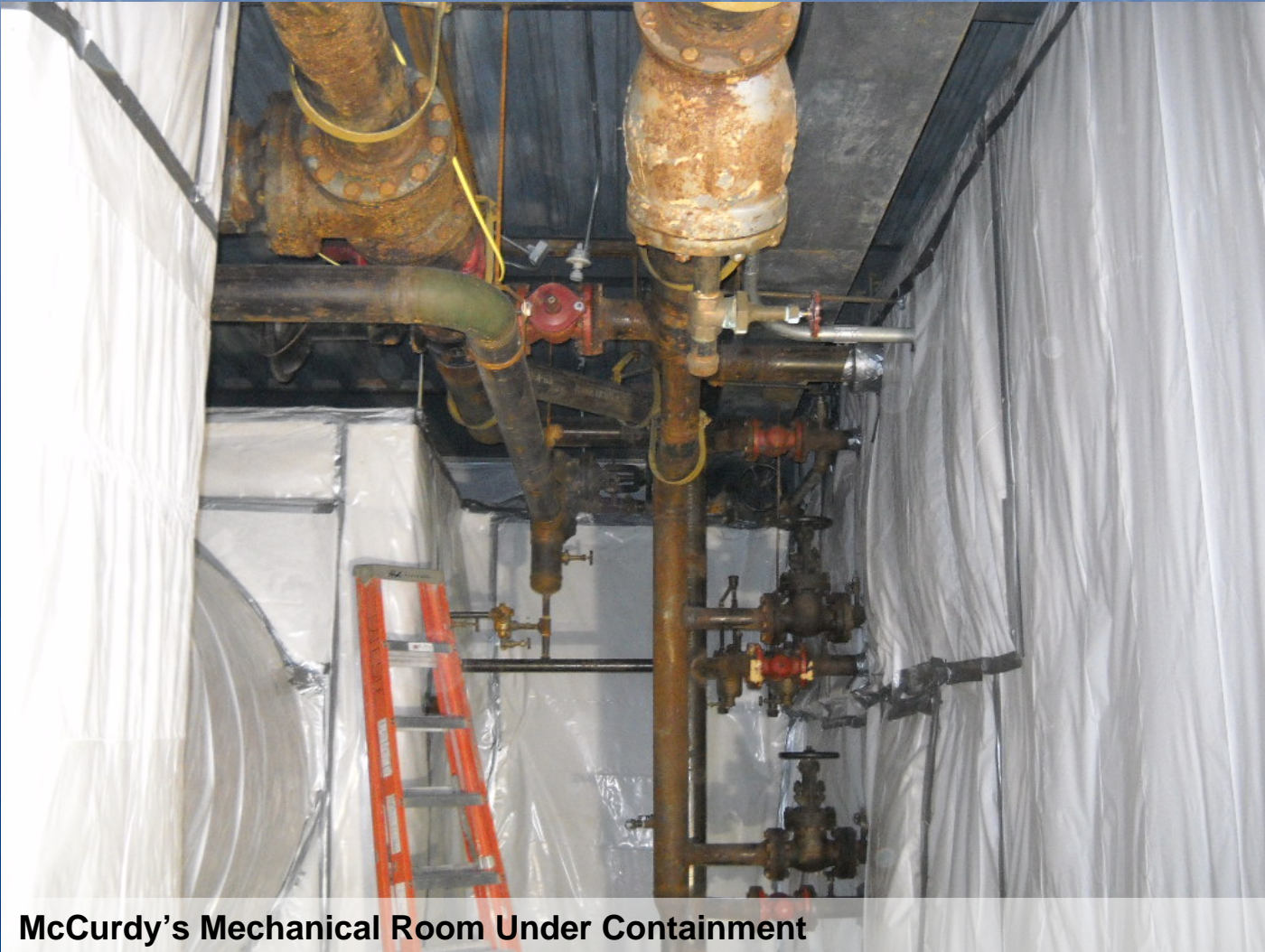
McCurdy's Mechanical Room Under Containment