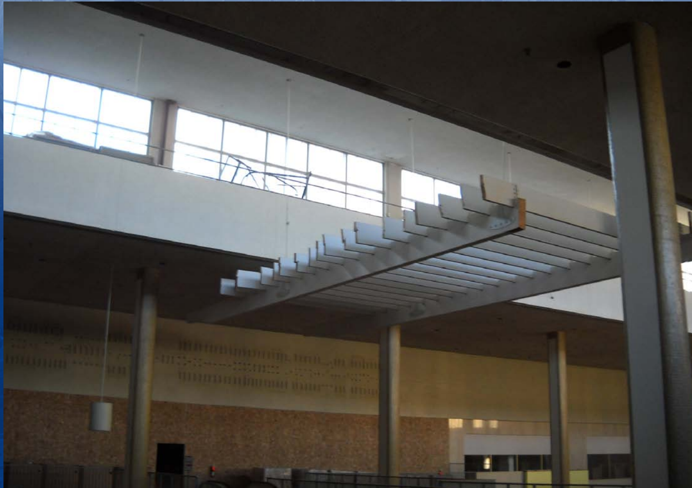
Mall 2 nd Floor Removal of Decorative Beams