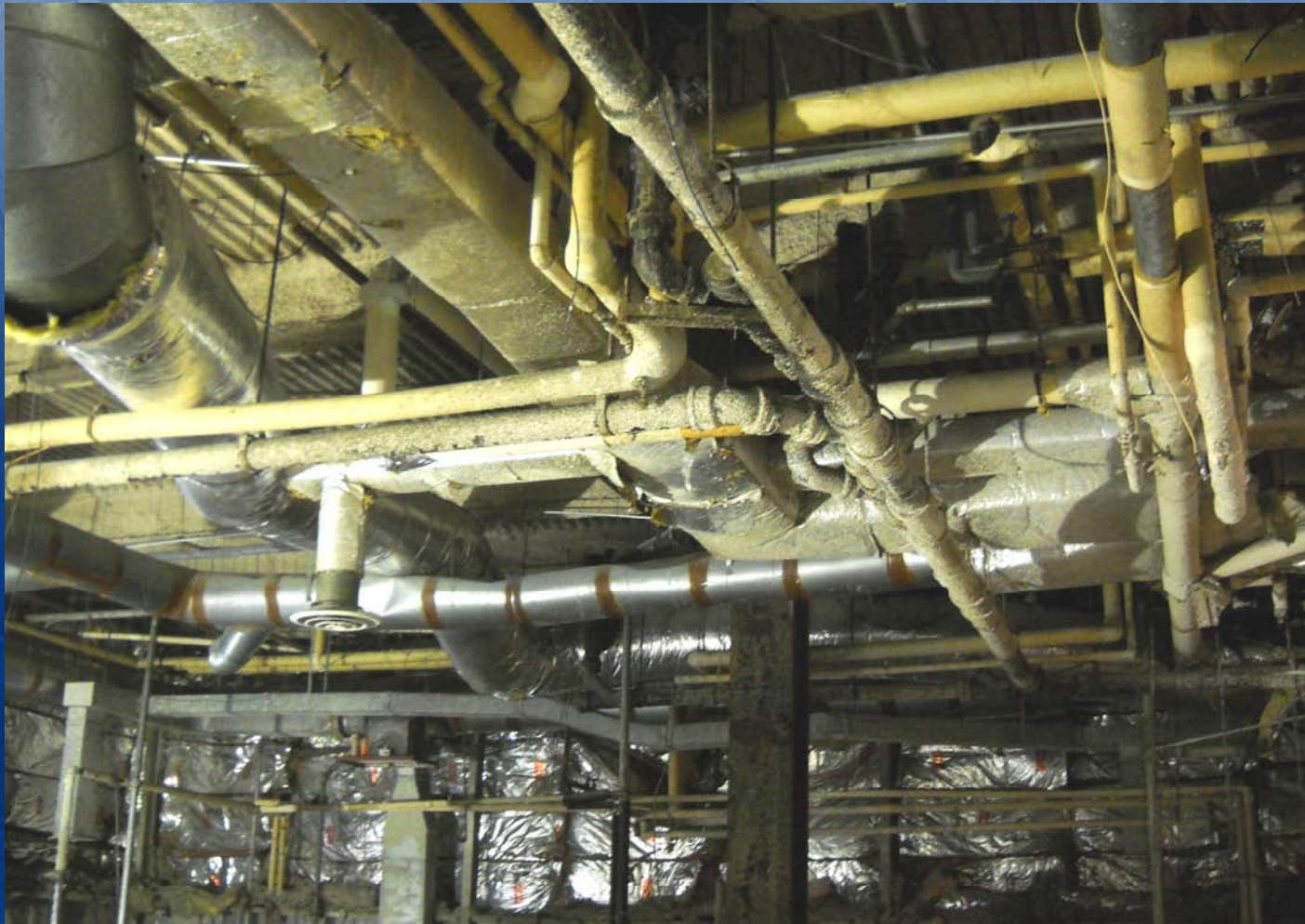
Tower 14 th Floor Above Ceiling Demolition