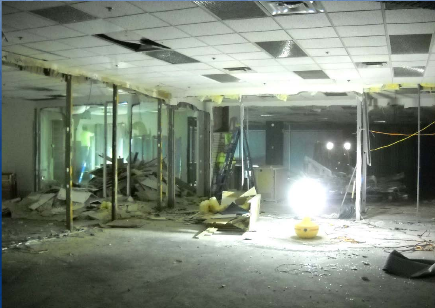
McCurdy's 6 th Floor Soft Demolition