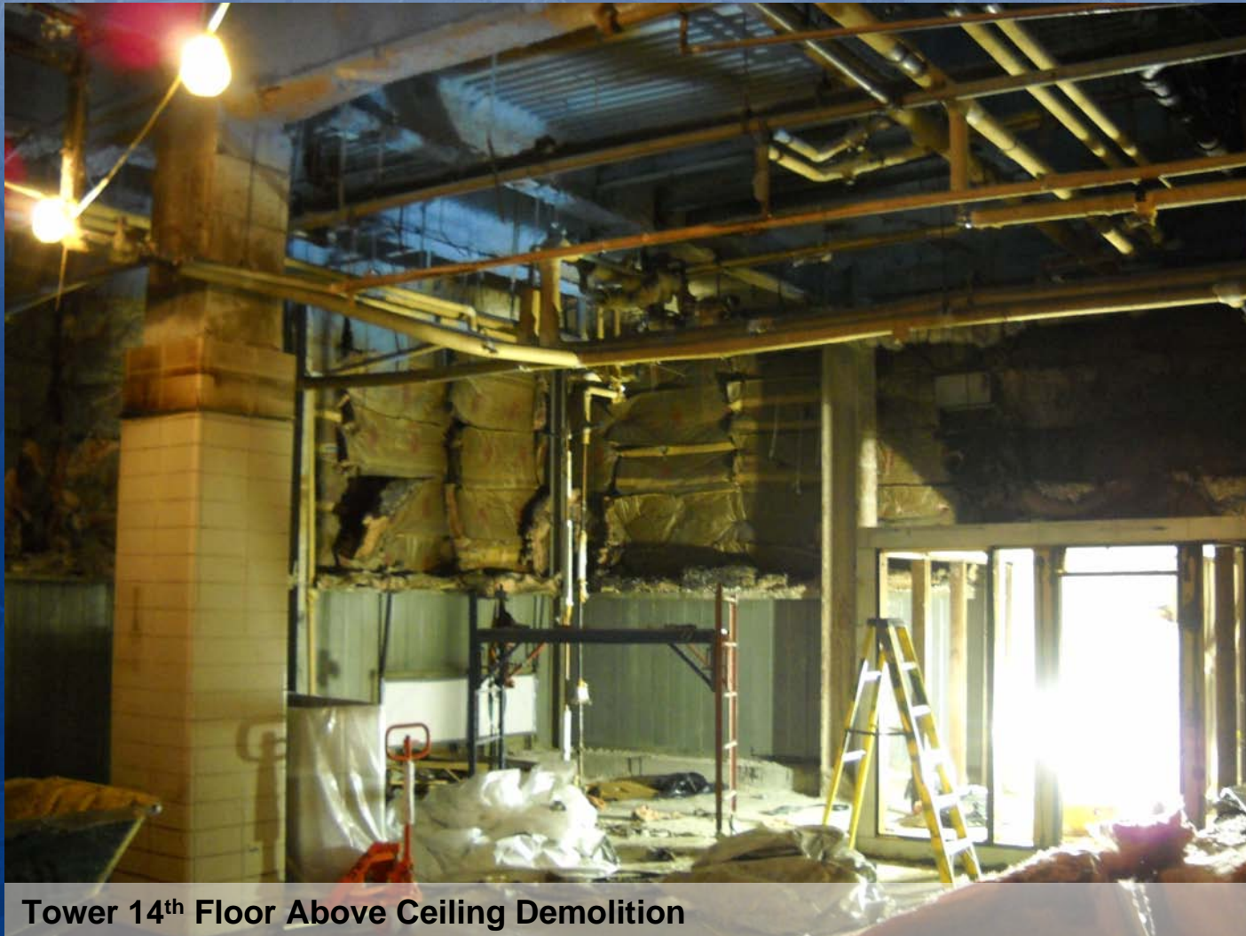
Tower 14 th Floor Above Ceiling Demolition