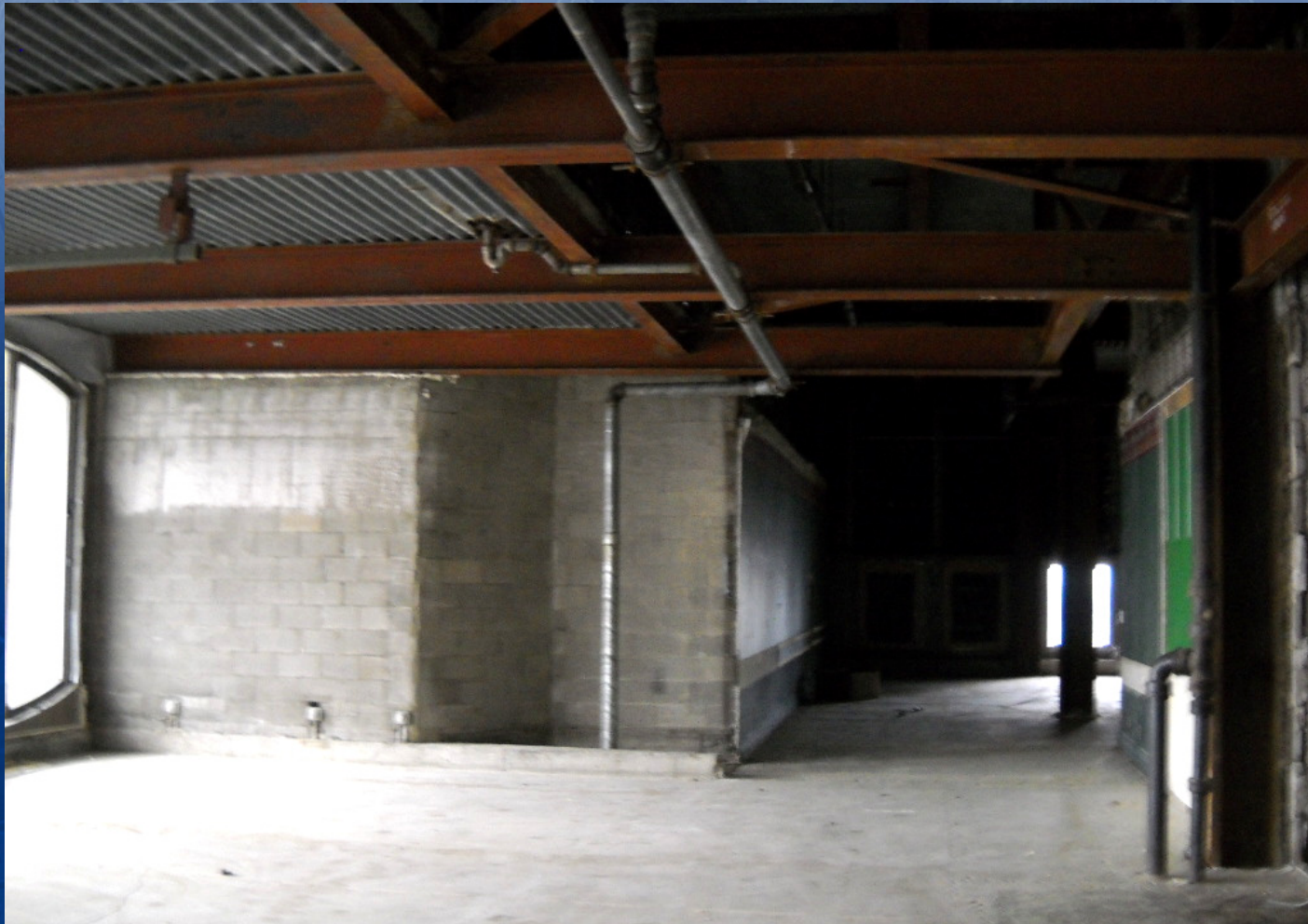
Tower 14 th Floor Post Abatement and Clearance