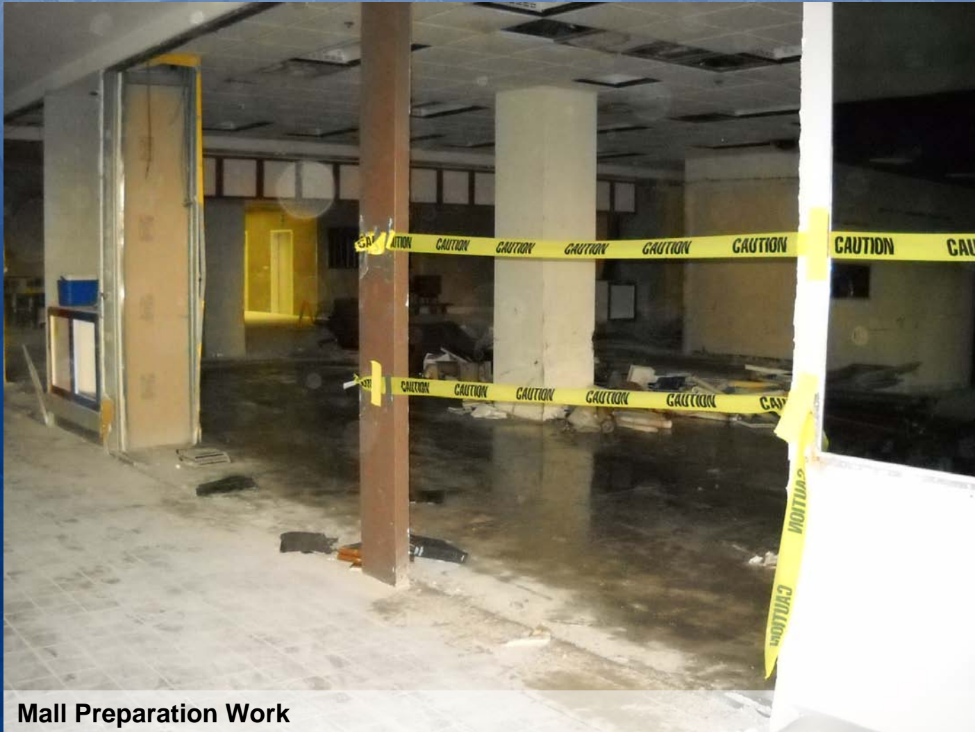
Mall Preparation Work