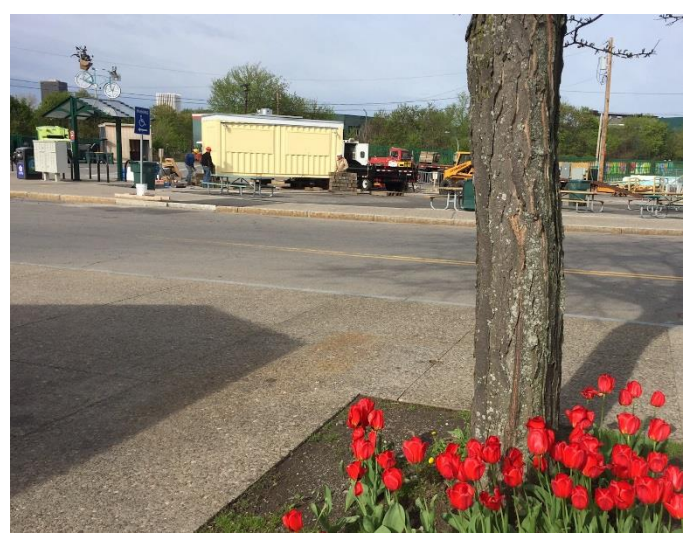
The interior of the new indoor "B" Shed, under construction...and some cheery spring bulbs on grounds, with building movers in the background preparing Cherry's European stand for its trip back to its original location on the east end of the indoor Shed. (Our new bike sculpture, atop the covered bike parking, is visible here too!)