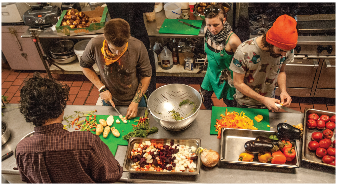
Prepping at St. Joseph's House of Hospitality