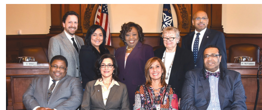
Rochester City Council

on Friday, June 2 at the Rundel Memorial Building at the Central Library for an opening reception of the exhibit which features an eclectic mix of historical artifacts such as Susan B. Anthony's dress, Martha Matilda Harper's prototype for the original salon shampoo chair, a Bloomer costume, a variety of suffrage banners, pendants, flyers and more! FREE admission. www.rocsuffrage.org .