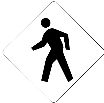
W11-2 30" x 30"