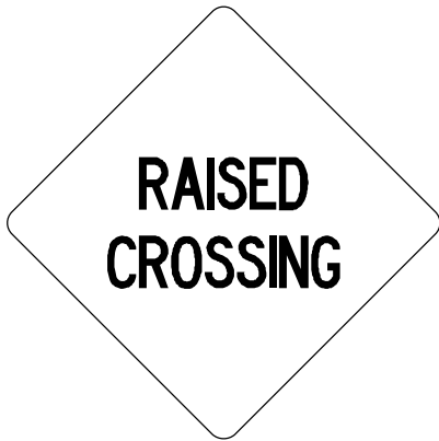
W17-1 30" x 30"