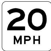
W13-1 18" x 18"