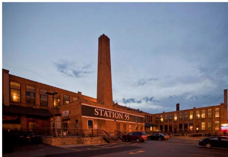
Eyesore no more! The Station 55 complex at 55 Railroad Street in 2000 (above) and today.

As recently as last decade, Railroad Street leading into the Market from East Main was in pretty rough shape. The building at 55 Railroad Street was actually torched by an arsonist around 2001, leaving an eerie shell as seen here. Thanks to the vision and commitment of Constanza Enterprises, the shell was transformed in 2009 into a gorgeous mix of residential units and office/commercial space—all of which is in high demand today. Railroad Street's revitalization is proof that business, citizens, and government together can accomplish extraordinary things!