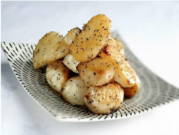
Turnips (yes, turnips!) are local veggies available at Market this time of year, and can be turned into tasty and healthy dishes such as this roasted version.

We're far removed now from the end of last year's growing and harvest season, but there are still plenty of local vegetables and fruits available at the Market—varieties that can be cultivated and harvested late into the calendar year, and stored well over the winter. Here's local produce you get at Market in March and April: