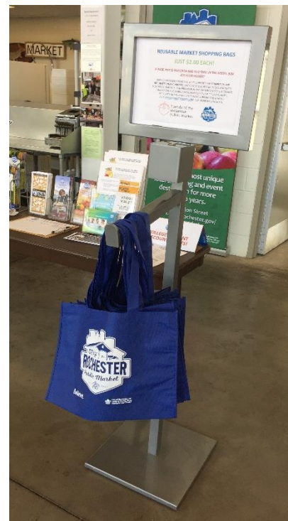
Find this bag dispenser and $2.00 reusable Market shopping bags in the center of the indoor shed.

See the full 2018 special events schedule at www.cityofrochester.gov/marketevents .