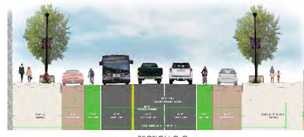
SECTION C-C EAST SIDE - LOOKING EAST