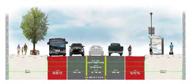
SECTION A-A WEST SIDE - LOOKING EAST

Jeffery Mroczek, City of Rochester Jeff.Mroczek@CityofRochester.Gov http://www.cityofrochester.gov/mainstreet2/