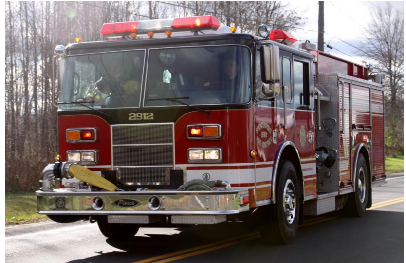
Fire and Rescue Services and