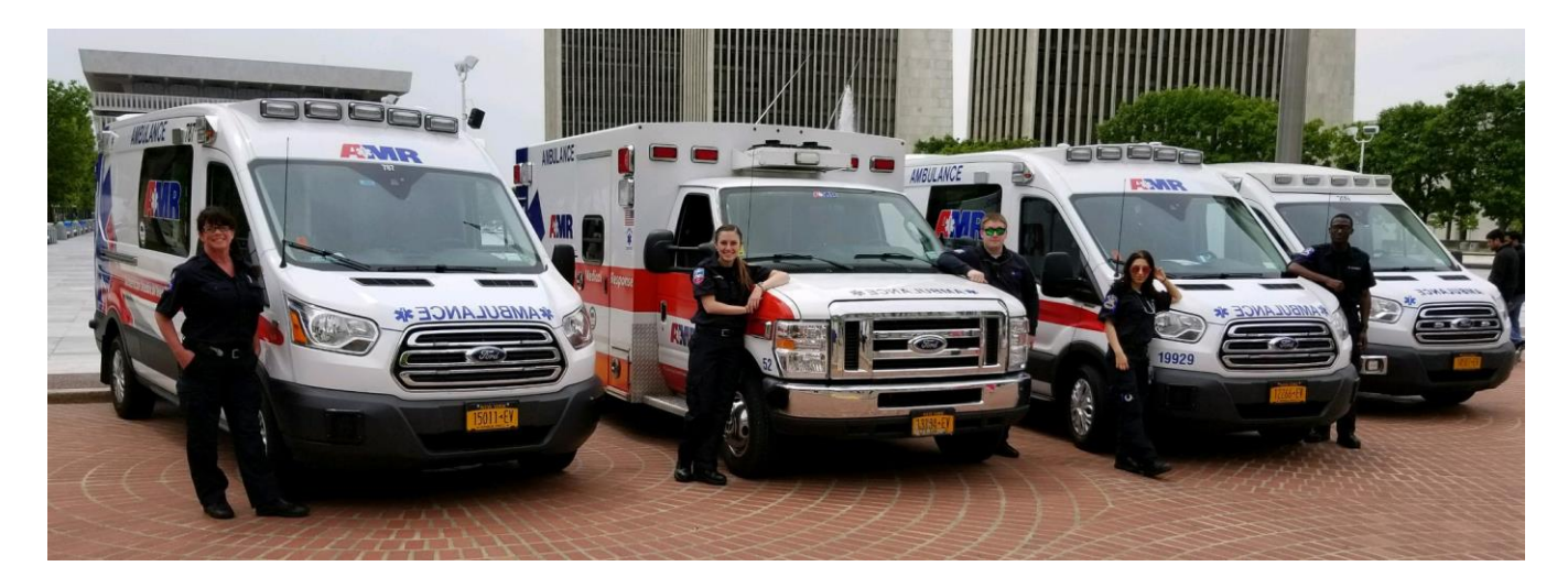
Emergency Medical Services