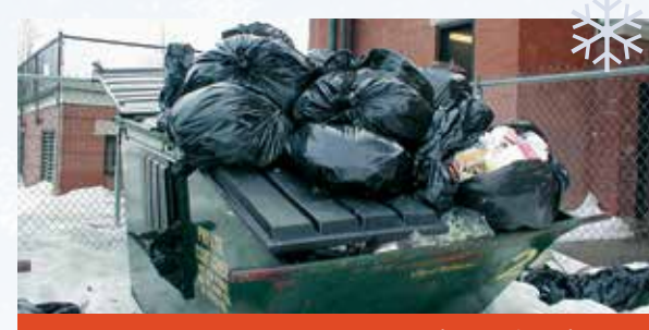
No: overloaded and access unavailable for pickup

Curb service customers: DO NOT place containers on top of snow banks, in the street or on the sidewalk, where they might hamper traffic and snow removal activities.