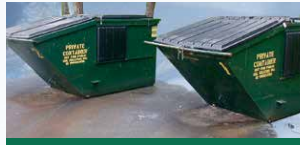
Yes: proper access for refuse pickup