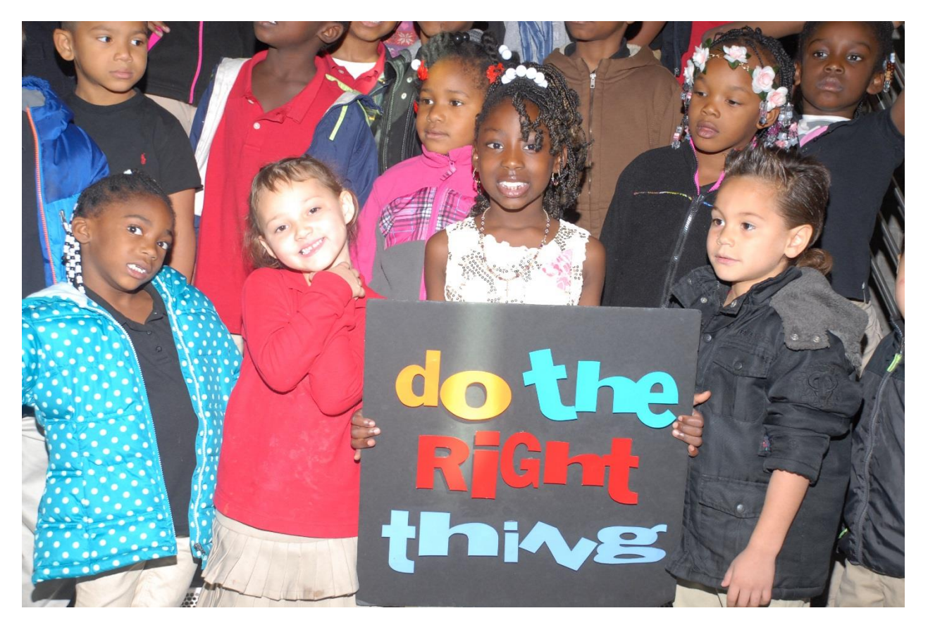
Rochester Police Department 185 Exchange Boulevard, Rochester, New York, 14614