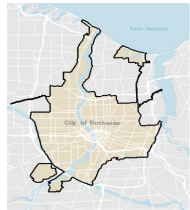
City of Rochester Map

Access to healthy food is an important component of community and individual health, but too many Rochester residents experience barriers to healthy, affordable food: