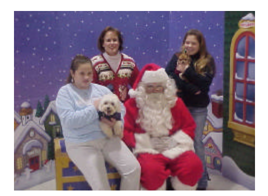
Volunteers assisted with photos with Santa Claws at both PETsMART locations

dling another animal. Thanks and keep up the great work!