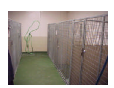
Dog Isolation is site of proposed surgery room and observation area.

Last issue you may recall reading about the $10,000 grant we received from PETsMART Charities for surgical and caging equipment required for establishing an on-site surgical unit. That money has been deposited and is being held until additional funds become available. The estimated total expense for construction and equipment was around $45,000. We have acquired approximately $6,000 of equipment plus another $5,500 in unsolicited donations. There-