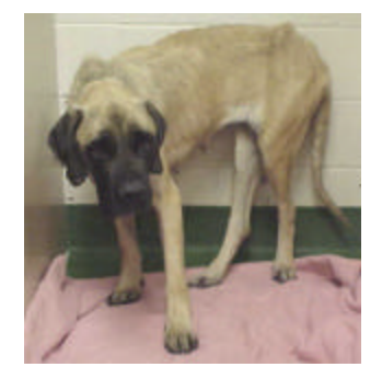
Malnourished mastiff at shelter before being adopted by Mastiff Club of American