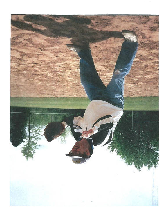
An Irish Blessing

May the road rise up to meet you, May the wind be always at your back. May the sun shine warm upon your face, And rains fall soft upon your fields, And until we meet again, May God keep you in the hallow of His hand.