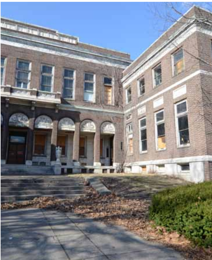
Eastman Dental Dispensary Building

Here are some of buildings in Rochester that we are working to save through adaptive re-use: