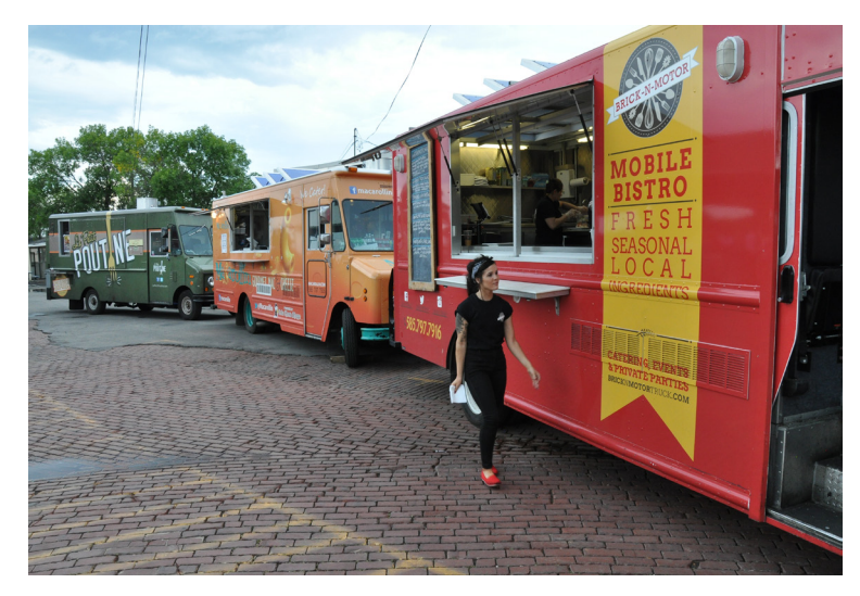
FOOD TRUCK RODEOS: STREET CUISINE HEAVEN