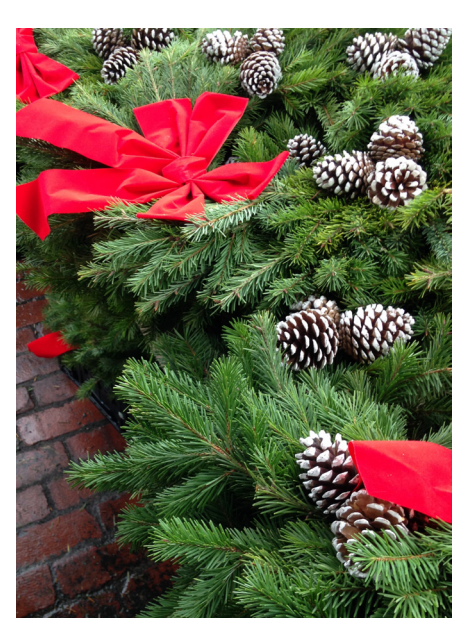
HOLIDAYS AT THE MARKET