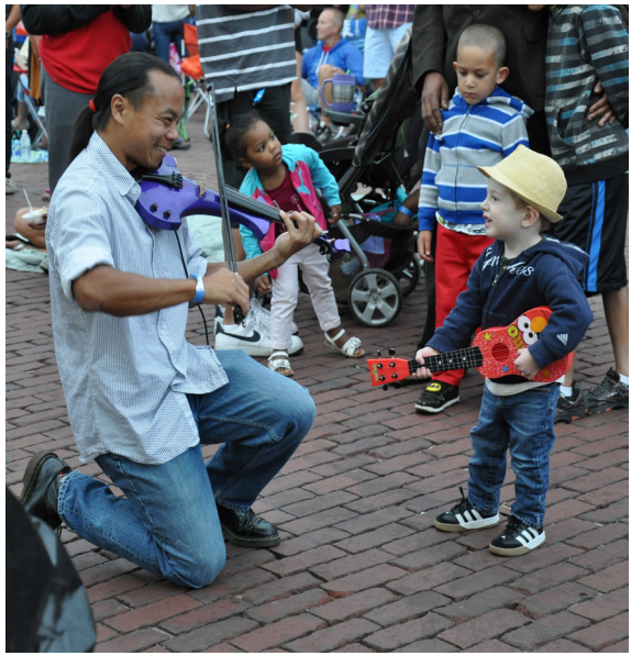
BANDS ON THE BRICKS