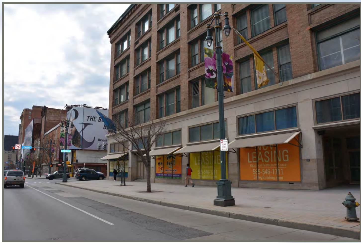
EXISTING CONDITION PHOTO