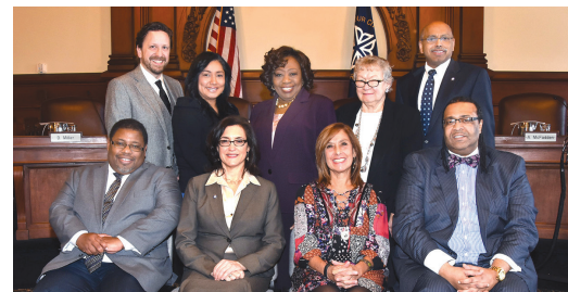
Rochester City Council