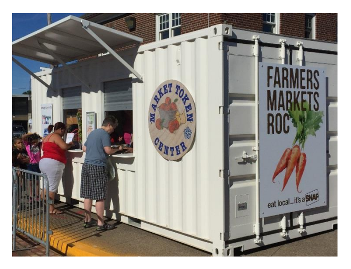
The Market Token Center, custom-fabricated from a repurposed shipping container, is right behind the Market Office building.

Some have said that one of the reasons for the success of this program is the high levels of poverty