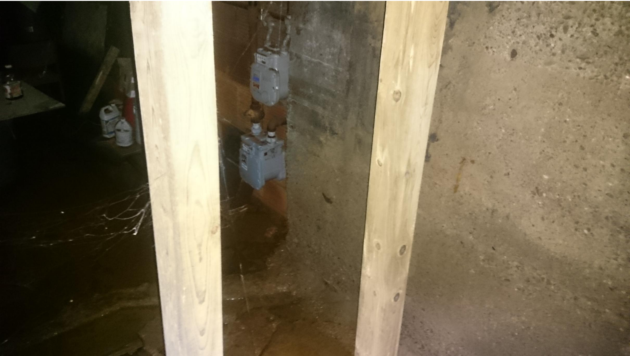
Figure 4: Looking south into basement