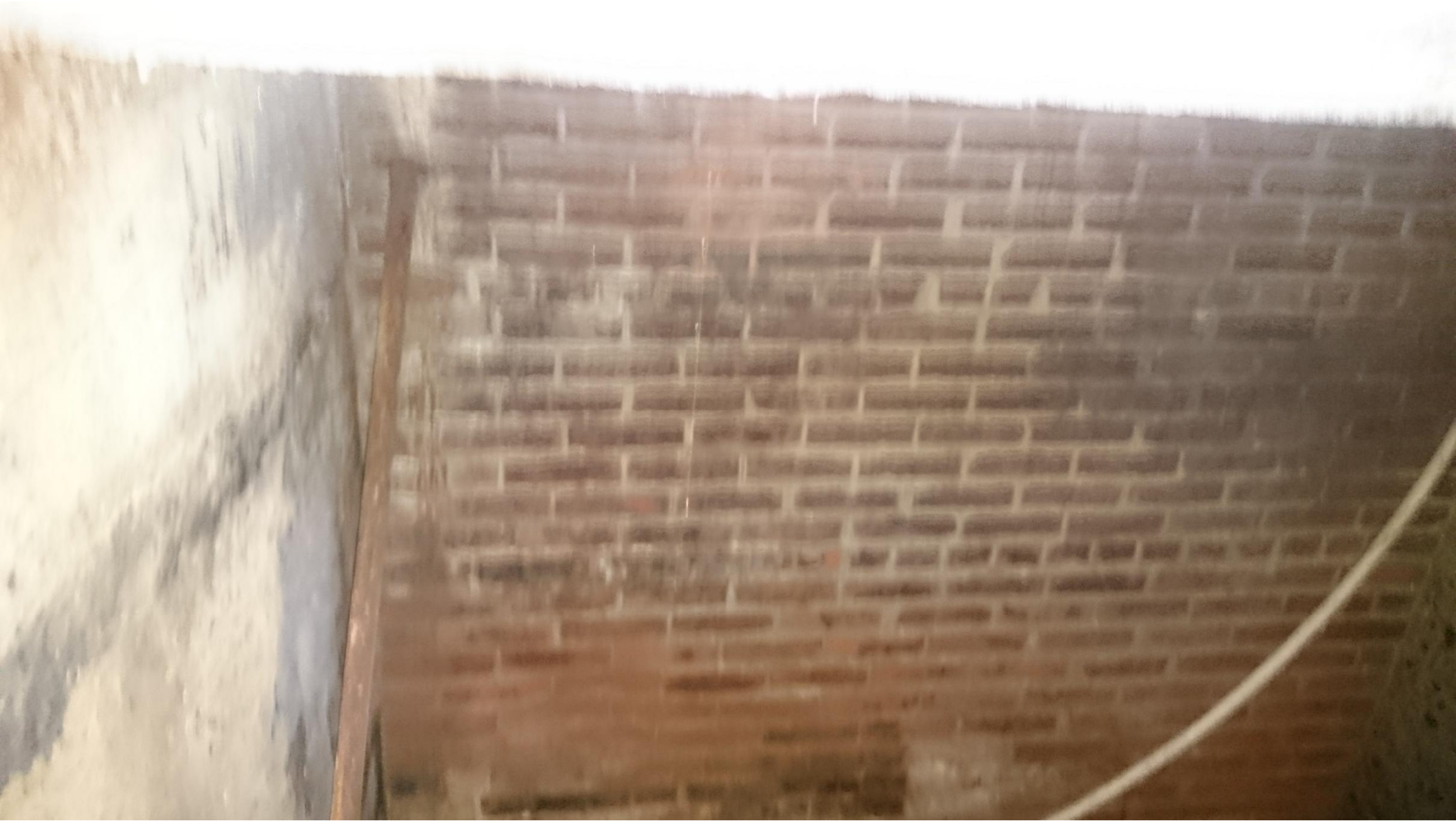
Figure 2: Looking east