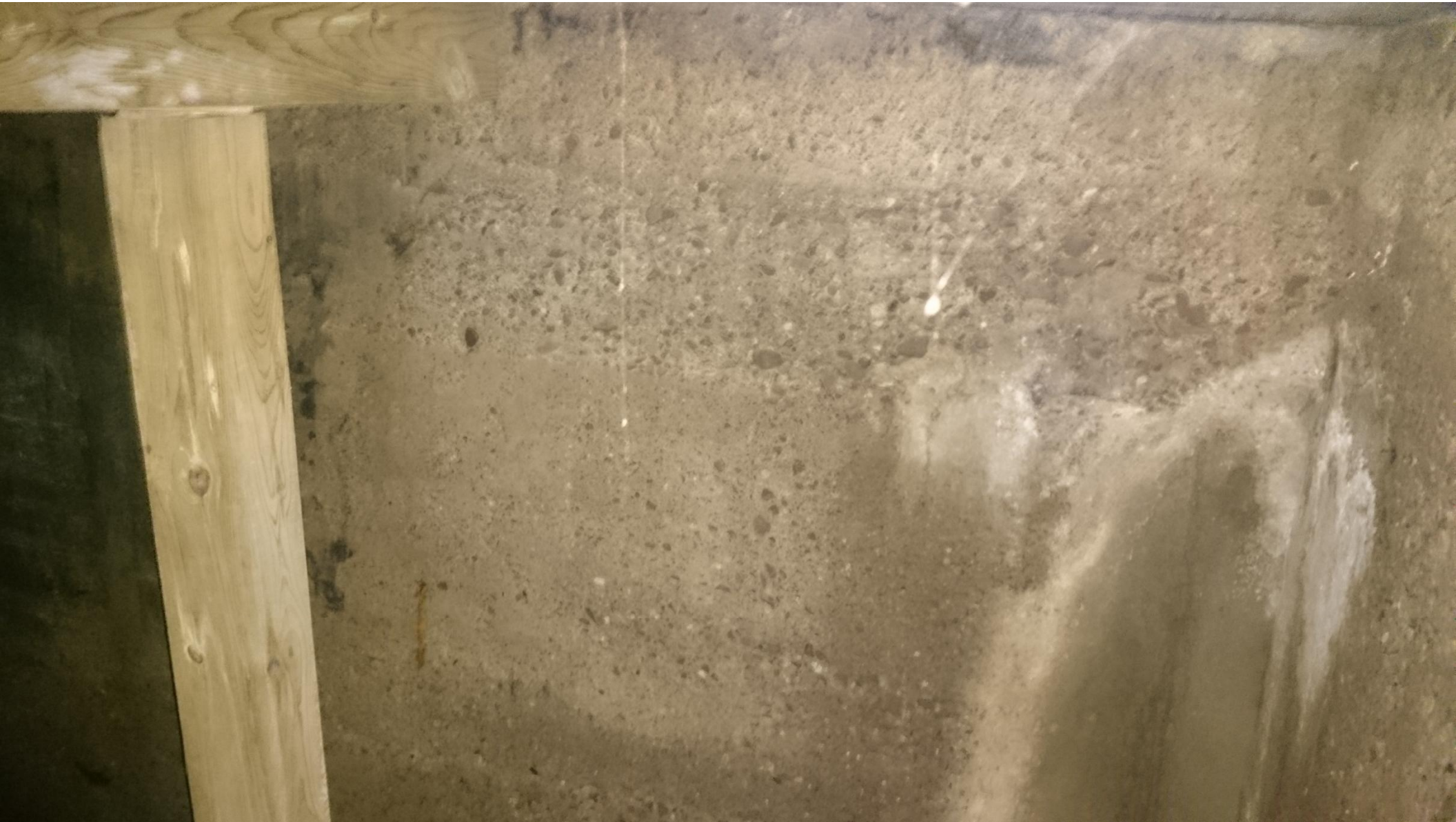
Figure 5: Looking west