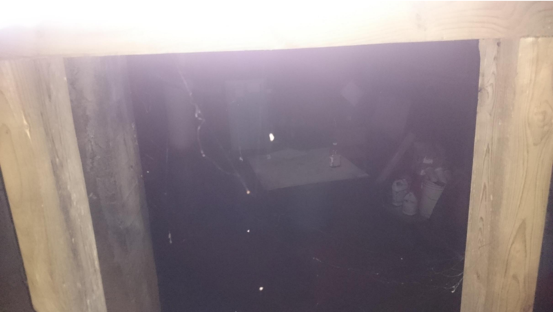
Figure 3: Looking south into basement