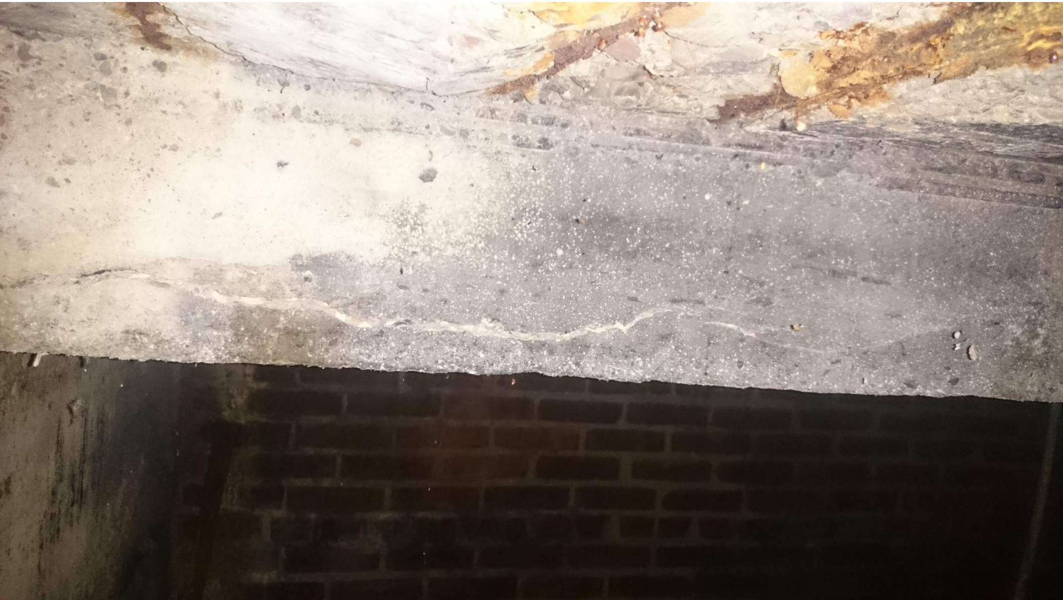
Figure 1: Looking east