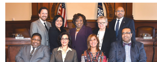
Rochester City Council